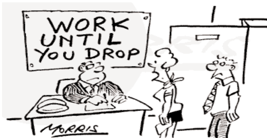
"It's the new man - he wants to know what the company retirement plan is."

www.starbucksunion.org for further details."