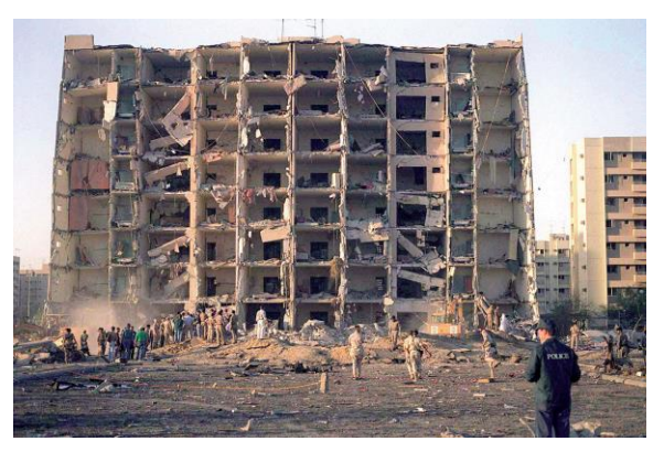
Khobar Towers, Saudi Arabia

After the attacks of September 11, 2001, the Iranian regime assisted the Taliban, Al-Qaeda and radical Shiite militias battling U.S. and allied soldiers in Afghanistan and Iraq.<sup>26</sup> This support included safe harbors, training and the provision of advanced weapons including sophisticated improvised explosive devices. The Iranian