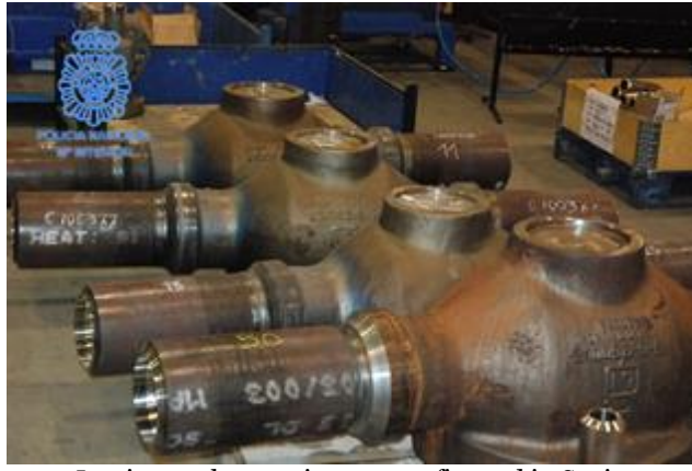
Iranian nuclear equipment confiscated in Spain

However, the Supreme Leader can overrule anyone, including Islamic law and his own previous statements. The Washington Institute for Near East