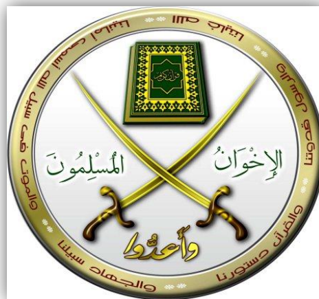
Figure 1 The Brotherhood's motto is written on the outer circle of its logo. The word beneath the swords translates to "Make Ready," which is a reference to a Quranic verse exhorting Muslims to prepare for war against the enemies of Allah (Surah 8:60)

Until recently, the Brotherhood's motto published publicly was: "Allah is our objective. The prophet is our exemplar. The Quran is our law. Jihad is our way. Dying in the way of Allah is our highest hope." This motto is no longer displayed on official Ikhwan (Brotherhood) publications.