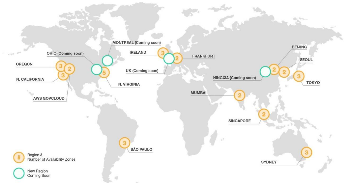
Figure 2 – AWS Global Regions

AWS data centres are built in clusters in various global regions. We refer to each of our data centre clusters in a given country as a “Region.” Customers have access to thirteen AWS Regions around the globe 8 , including an Asia Pacific (Sydney) region. Customers can choose to use one Region, all Regions or any combination of Regions. Figure 2 shows AWS Region locations: