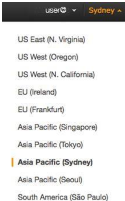
Figure 3 – Selecting AWS Global Regions in the AWS Management Console

When using the AWS management console, or in placing a request through an AWS Application Programming Interface (API), the customer identifies the particular Region or Regions where it wishes to use AWS services. Figure 3: Selecting AWS Global Regions provides an example of when uploading content to an AWS storage service or provisioning compute resources using the AWS management console.