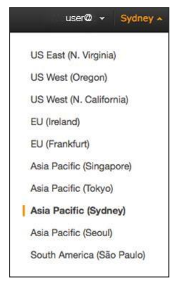
Figure 3 – Selecting AWS Global Regions in the AWS Management Console

When using the AWS management console, or in placing a request through an AWS Application Programming Interface (API), the customer identifies the particular Region or Regions where it wishes to use AWS services. Figure 3: Selecting AWS Global Regions provides an example of when uploading content to an AWS storage service or provisioning compute resources using the AWS management console.