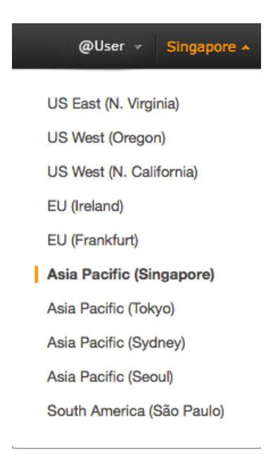
Figure 3 – Selecting AWS Global Regions in the AWS Management Console

When using the AWS management console, or in placing a request through an AWS Application Programming Interface (API), the customer identifies the particular Region or Regions where it wishes to use AWS services. Figure 3: Selecting AWS Global Regions provides an example of when uploading content to an AWS storage service or provisioning compute resources using the AWS management console.