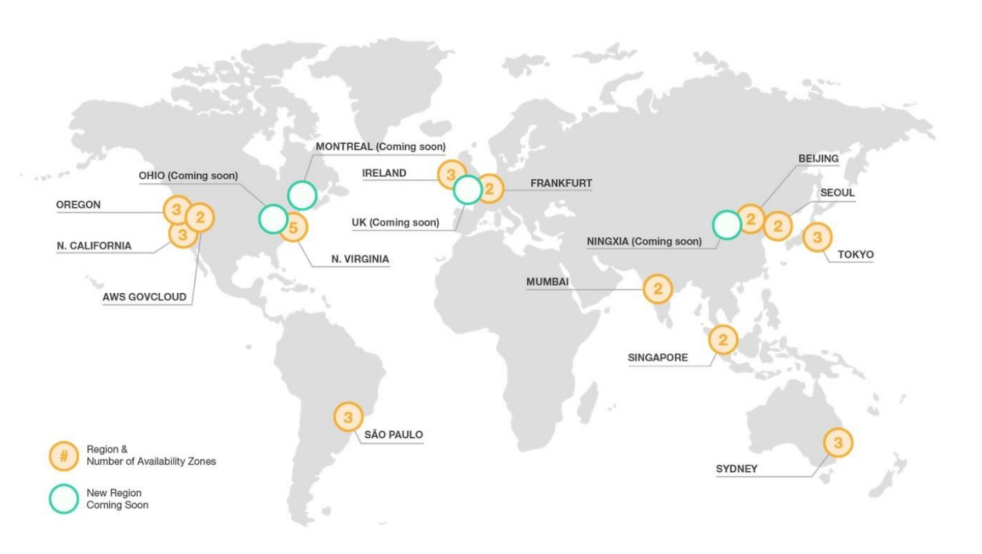
Figure 2 - AWS Global Regions

AWS data centers are built in clusters in various global regions. We refer to each of our data center clusters in a given country as a "Region". Customers have access to thirteen AWS Regions around the globe<sup>8</sup>, including an Asia Pacific (Singapore) Region. Customers can choose to use one Region, all Regions or any combination of Regions. Figure 2 shows AWS Region locations: