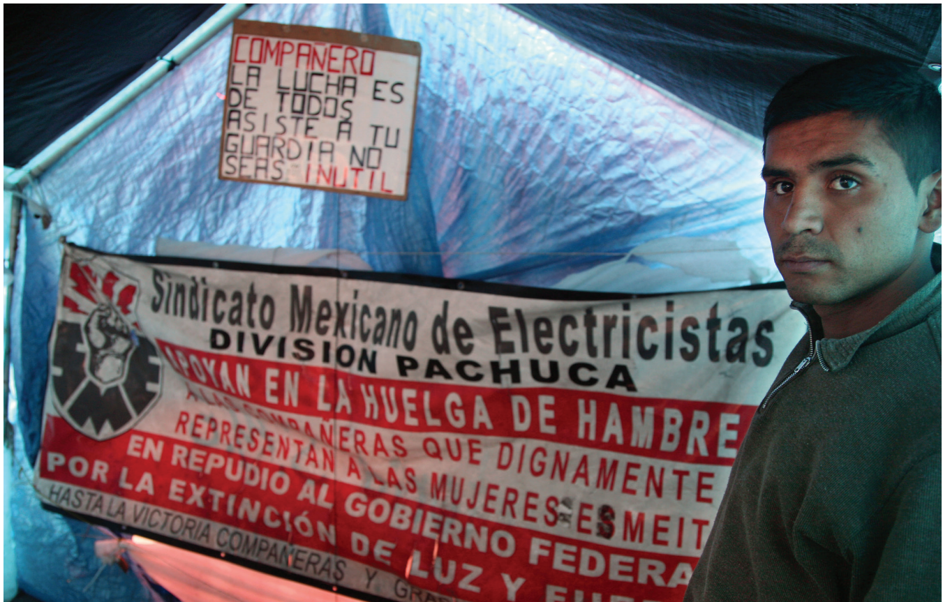
Fired electrical worker Leobardo Benitez, Central Light and Power ( Luz y Fuerza del Centro [LyFC] ), Mexico.

Worker rights obligations never have been enforced fully under existing free trade agreements. To let the TPP enter into force without full compliance with all labor commitments from all 12 countries undermines the entire agreement and reduces the prospect for wage growth in Pacific Rim countries. The TPP sets no minimum standards for minimum wage, hours of work or health and safety protections, and stipulates only that these obligations will be satisfied "as determined by" each country. A TPP country legally can set a minimum wage of a penny an hour. As a result, migrant workers in Pacific Rim countries would continue to disproportionately face low wages, dangerous conditions, harsh enforcement policies, employer exploitation and immigration visa schemes that limit rights.