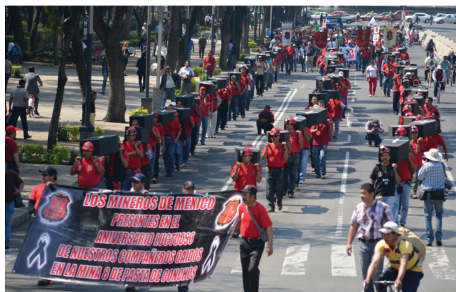
Los Mineros members carry coffins through the streets of Mexico City to commemorate the anniversary of the Pasta de Conchos disaster.

Workers must stand together to forge a path toward higher living standards, strong democracies, wage growth and decent work. This means rejecting the politics and policies that divide us and only serve the interests of the powerful. This means standing up for immigrant rights, and the labor rights of all workers. And this means standing for pro-worker trade policies, not corporate-driven agreements like the TPP.