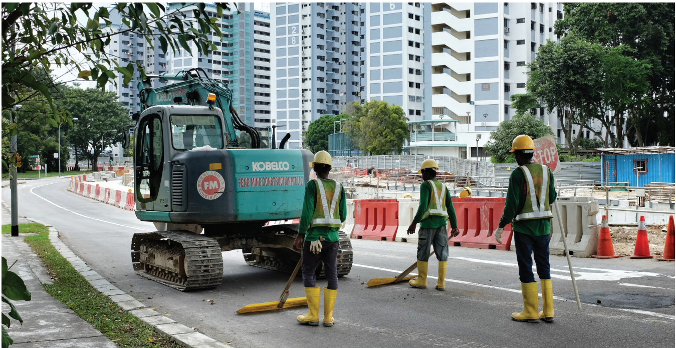
Workers in Singapore.

In 2011, the AFL-CIO joined with labor federations from the majority of TPP countries to draft and submit a comprehensive labor chapter that would address shortcomings of prior trade deals. Too many trade agreements include symbolic commitments to improve labor rights that lack reliable enforcement plans.