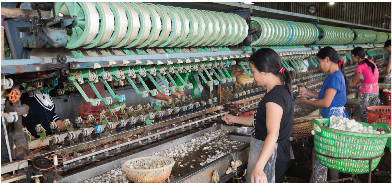
Vietnamese women working in silk factory.

The economic, social and environmental forces that would be fostered by the TPP would have a devastating impact on the stability of communities, especially those in developing countries. It is likely that the TPP, if enacted, would perpetuate conditions of deprivation and instability that so often drive forced migration. As will be discussed, the TPP also does little to ensure migrant workers' rights will be protected as they move throughout the Pacific Rim.