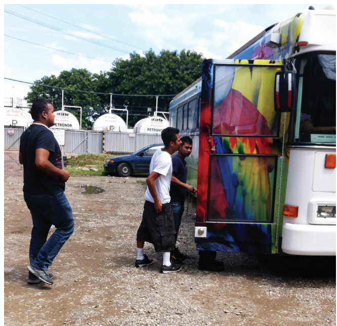
Returned migrants boarding a bus in San Pedro Sula, Honduras.