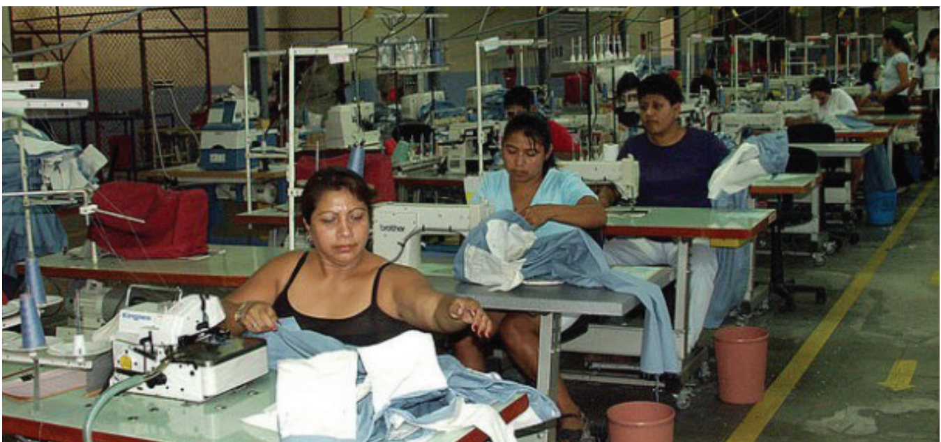
Factory workers make sportswear for a U.S. brand at a maquila plant in the San Bartolo free trade zone in the city of Ilopango in eastern El Salvador.

Corporations and investors utilize ISDS as another tool to manipulate the rules of the economy and fight a pro-worker agenda. This could include opposing rights-based immigration policy reforms. For example, activists are campaigning to stop deportations and family detention, and have called for an end to the use of for-profit private detention facilities in immigration enforcement. Immigrant communities and advocates seek to eliminate the toxic