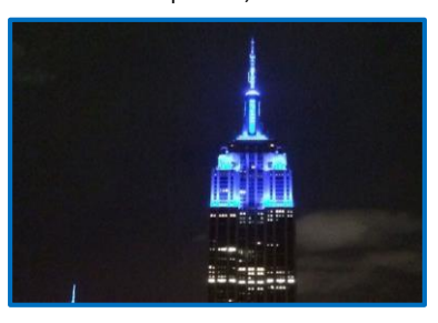
Empire State Building, New York