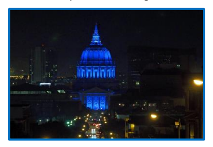
City Hall, San Francisco