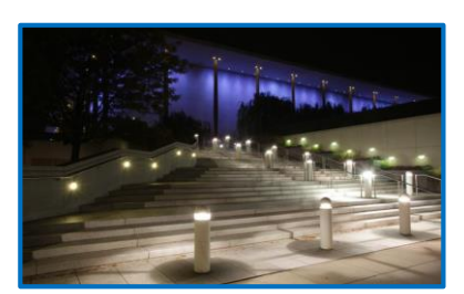
Kennedy Center, Washington DC