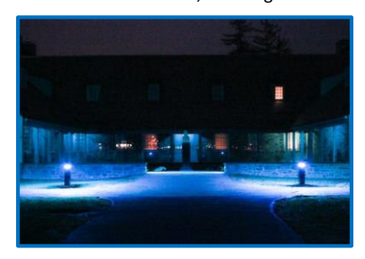
FDR Presidential Library, New York