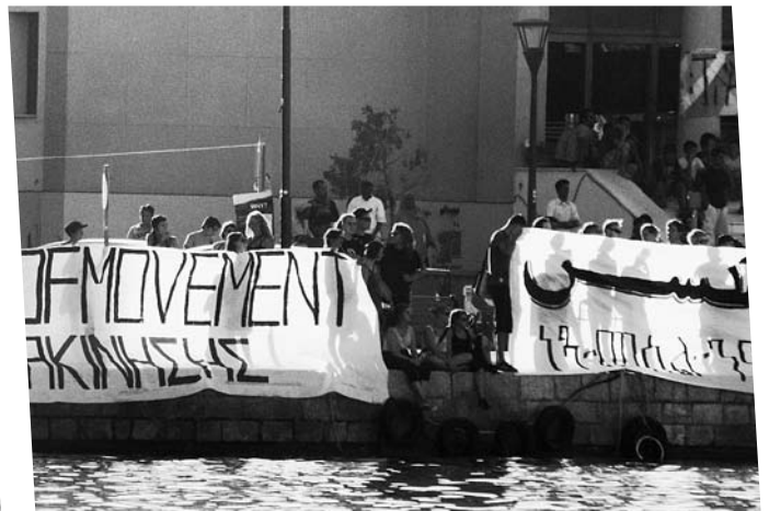
// Place of the Infopoint before, during and after //