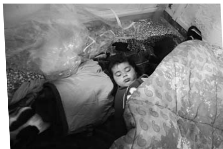
Inside the University