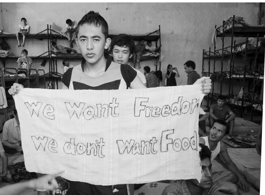
Minors Protesting inside Pagan August 2009

... when the man at the 24-hours-kiosk offered mobile phone charging for free.