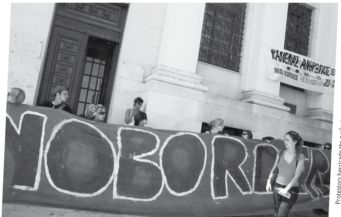
Protestors barricade the prefecture

One evening a guy from Switzerland appeared at the Infopoint. He was living in Switzerland for many years. A long time ago he arrived there, coming from Afghanistan. He was visiting Lesvos as a tourist. On his first sightseeing-tour in Mitilini he discovered the Infopoint and started talking with the Afghan refugees. He observed one guy who arrived at the Infopoint to pick up his family. He had been deported from the UK and his family had just arrived that morning. Out of fear they had hid in the forest and they had spent the whole day without food and water. Now it was getting dark. They had a mobile but could not describe where they were. The son was able to convince the family to go to a shop and find out about their whereabouts. Some people went there to pick up the family. They arrived late at night very tired: his parents and another son with his wife and a small baby. The guy from Switzerland stayed at the Infopoint until the end. He was sure that he could not be on vacation there. He helped out a lot at the Infopoint, took part in the actions, visited Pagani with a delegation – and most importantly: he was able to have fun with a lot of the newcomers. Already on the first evening he gathered some youths together and played Afghan music on his laptop. At the last party he danced and drummed all night: »I felt so much at home here!« he said on the last day.