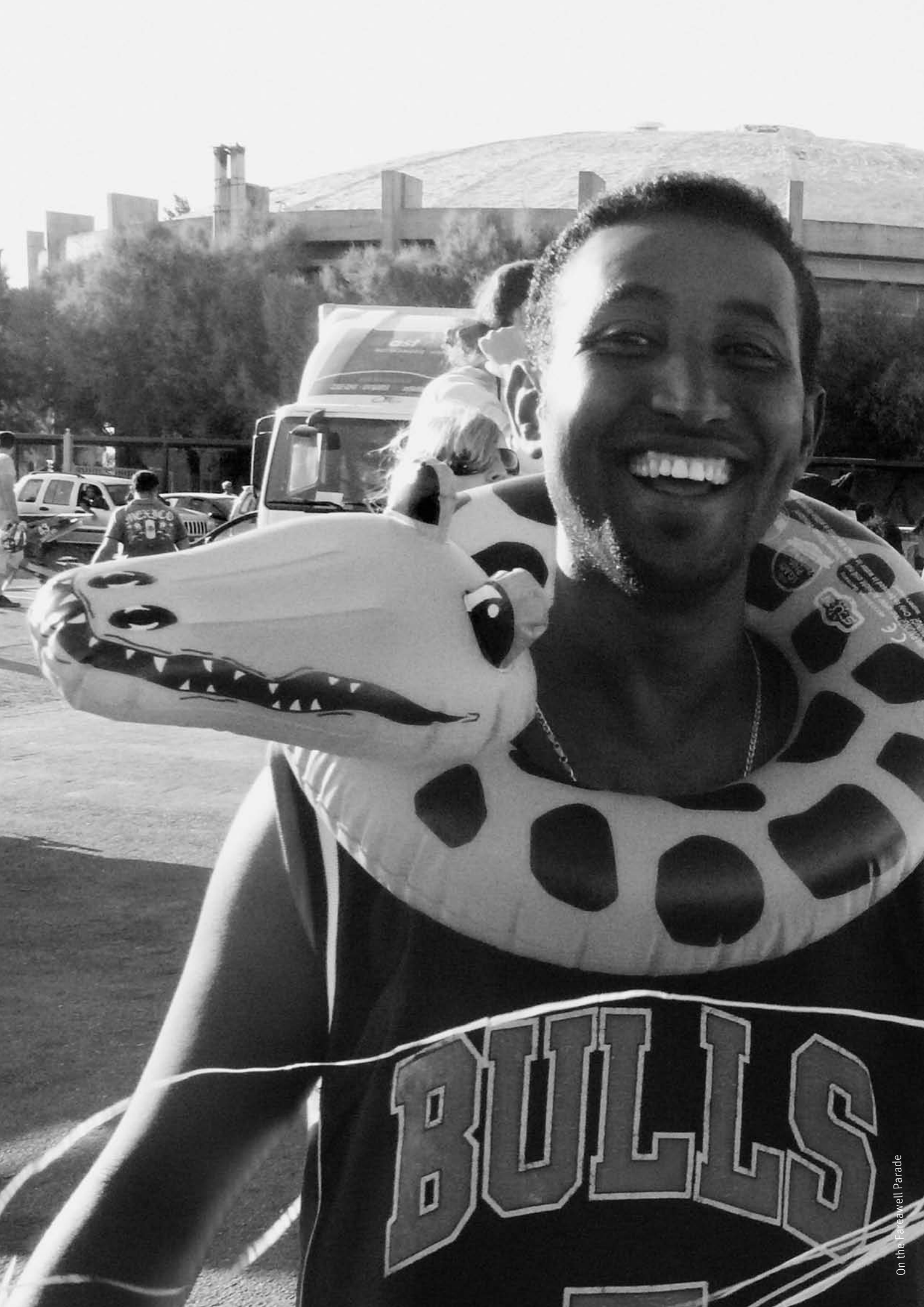
On the Farewell Parade