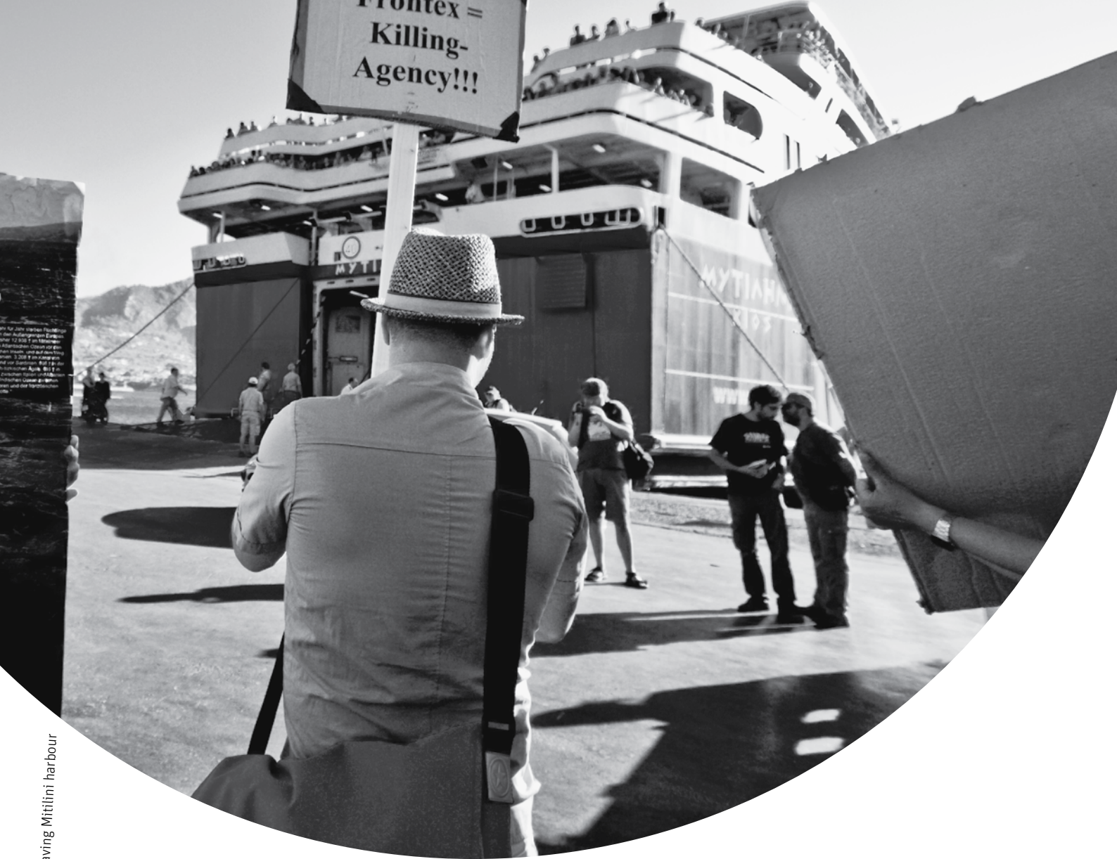
Ferry leaving Mitilini harbour