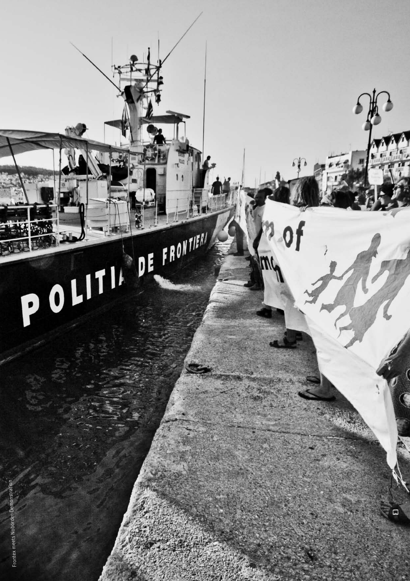
Frontex meets Noborder-Demonstration