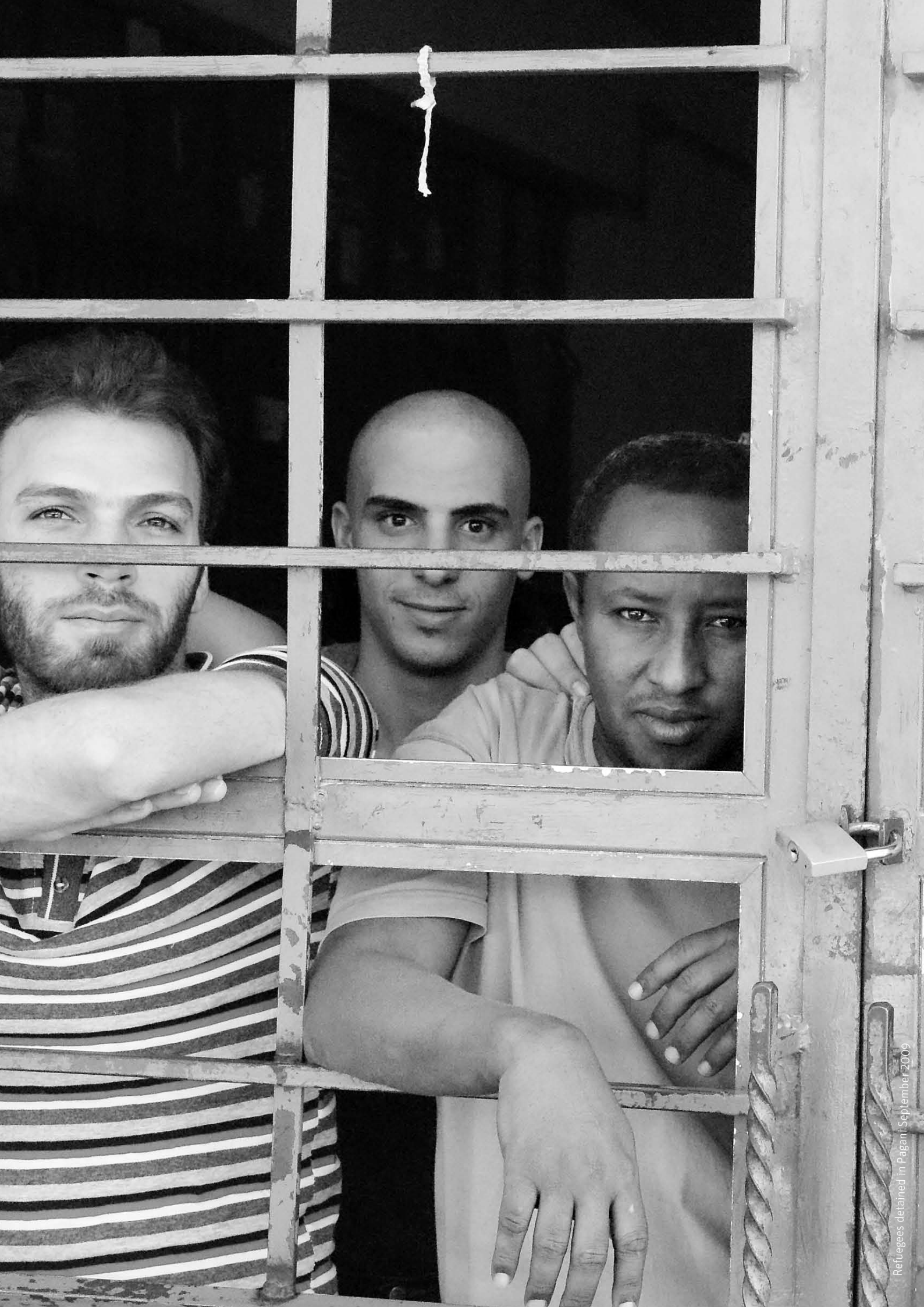
Refugees detained in Pagani September 2009