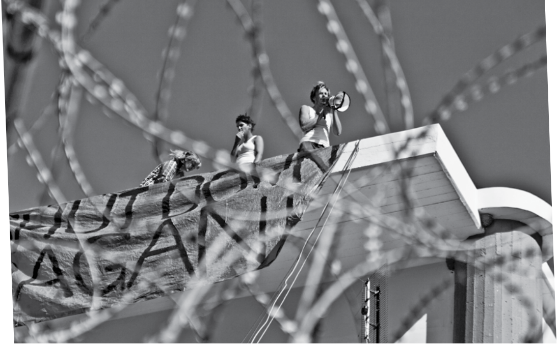
Squatting the roof of Pagani during the Noborder Camp