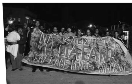
Demonstration in Mitilini