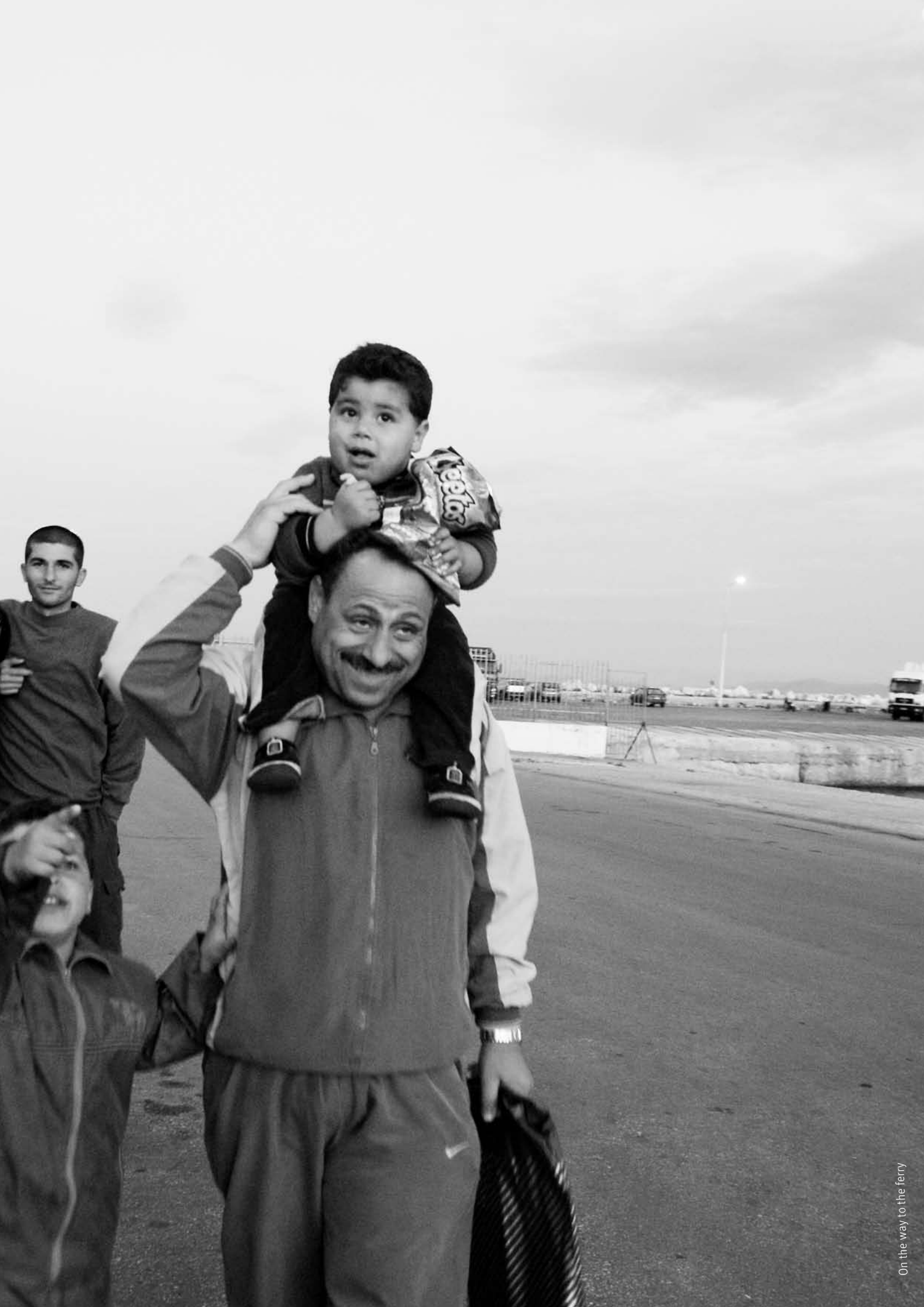
On the way to the ferry