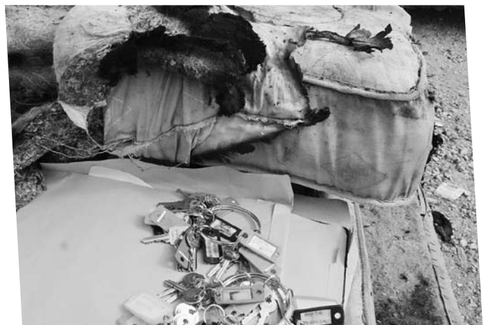
Release from Pagani // Burnt cells //