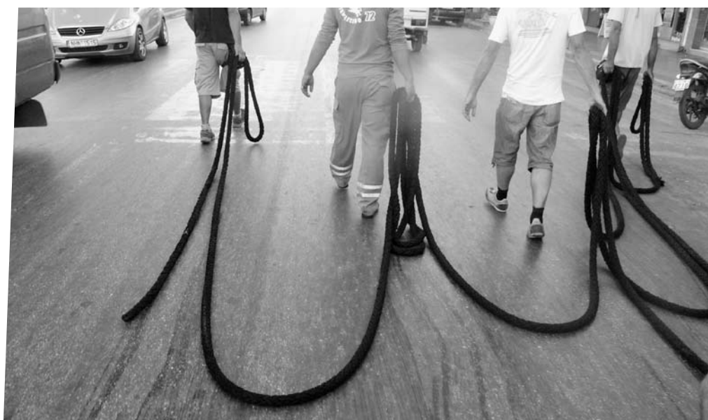
Rope of the Frontex Ship

2 Charamida is the name of the little village which was close to the NOBORDER CAMP.