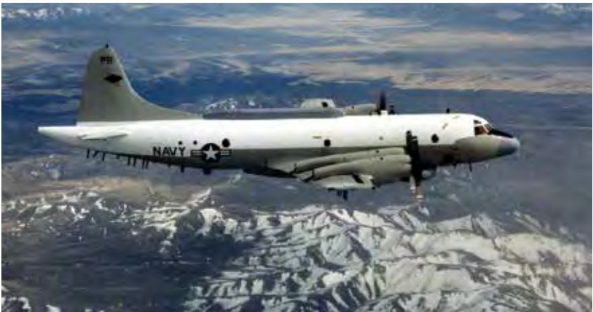
A U.S. Navy EP-3, similar to the aircraft which collided with a Chinese fighter jet above the South China Sea.

It is mid-morning. A four-engine propeller-driven U.S. Navy EP-3 reconnaissance plane is flying above the South China Sea near the Paracel Islands, at a mere 210 mph, on a routine intelligence-gathering mission. The sea-lane beneath the plane is an acknowledged part of China's "exclusive economic zone." International law grants free navigation in and above such zones to the ships and aircraft of all nations, but the United States and the People's Republic of China (PRC) disagree about whether or not this law includes military ships and aircraft.