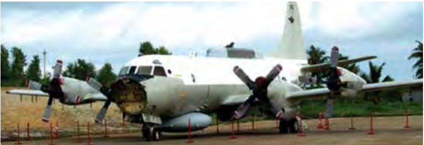
The damaged U.S. Navy EP-3 Reconnaissance plane in Chinese custody on Hainan Island. Visible are the cavity exposed by the missing nose cone, and the broken propeller of the number 1 engine (far right, above). The disassembled aircraft was eventually released to the U.S. Navy for repairs and refitting.