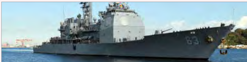
The USS Cowpens (CG-63), guided missile cruiser harrassed by a Chinese aircraft carrier, nearly collided with an escort vessel of the Chinese carrier.