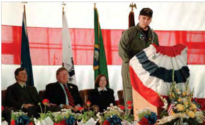
The U.S. Navy EP-3 pilot, Lt. Shane Osborn, is awarded the Distinguished Flying Cross for heroism and extraordinary achievement in flight.