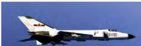
Aggressive Chinese fighter jet

This emergency issue of The Fatima Crusader is meant to be read and digested by you, word for word. If you don't, you won't be prepared for what is coming. There is HOPE, but only through obedience to the urgent requests at Fatima, which, as Pope John Paul II told us, are addressed to EVERY human being.