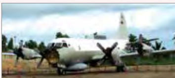
Damaged US Navy Plane in China