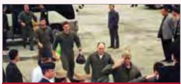
U.S. Navy crew released from interrogation