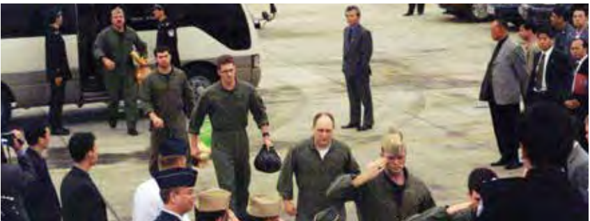
The 24-member flight crew of the U.S. Navy EP-3 is released after its eleven-day detention at a Chinese military installation on Hainan Island. The crew prepares to board the plane which will take them to Honolulu, Hawaii, on their way back to the Naval Air Station on Whidbey Island.

In the aftermath of the event, the Chinese pilot's widow received a personal letter of condolence from President Bush, and the U.S. agreed to compensate China for the 11 days' food and lodging given to the U.S. crew in the amount of $34,000. Although this incident occurred in 2001, we find ourselves encountering similar circumstances which could lead to much worse and much more dangerous confrontations today!