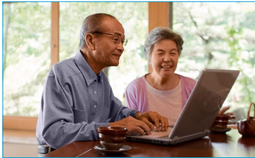
Improves service standards for customers