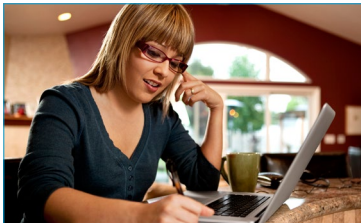
Flips its innovation-to-maintenance ratio

“FlexPod was the right solution for us because it’s reliable, scalable, and integrates well with our technology toolset for private cloud automation and orchestration,” says Shiladitya. “The prevalidated Cisco reference architectures fit our requirements perfectly, allowing us to move faster.”