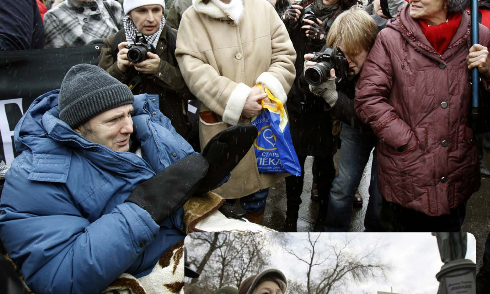
Top: Journalist Mikhail Beketov (L) in a wheelchair attends a rally to support assailed civil activists and reporters in Moscow November 21, 2010.