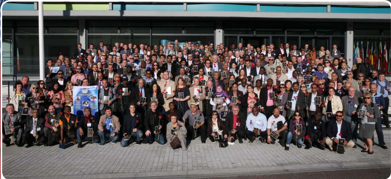
The IFJ World Congress in Dublin ( June 2013) honoured the memory of journalists and media staff killed: Delegates held roses for the group photo before going on a Freedom Walk through the streets of Dublin.