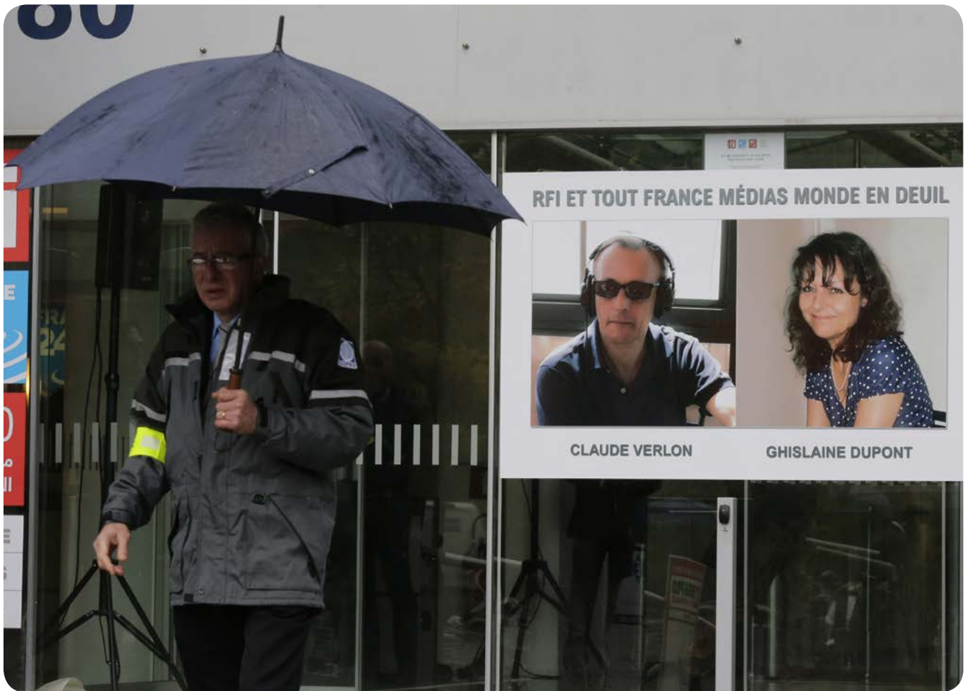
The two French journalists, who both worked for Radio France Internationale, were found dead in northern Mali on Saturday after being kidnapped in the city of Kidal.