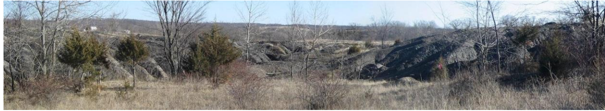
Vgcej "Ukg'Rtg/tgerco cvkqp"*Rj qvq'Eqwtvgt { "qh"Vtkh { f tq Corporation+"

o qtg'pcwntn'ncpf uecr g'yj cv'dngpf u'kp'v'yj g'uwttqwpf kpi "ci tlewnwntn'r cuwttgncpf 0"Vj g"Vgcej "ukg" y cu' qpeg" f gvtko gpwnt' vq' yj g' nqecr' gpv' y kj " ku' vqzle" CO F 0' Vj tqwi j " kppqxcvkg" gpi kpggtkpi . "j ctf "y qtm"cpf "uwr r qtv'd { "o wvkr ng"qti cplk cvkqpu."yj gug"j c| ctf u'y gtg"gnko kpcvgt 0" Vqf c { "yj g"tgemko gf "ukg"dngpf u'kp"uq"y gmi'y kj "yj g"uwttqwpf kpi "ncpf uecr g."yj cv'k'ku'kpetgf kdn { " f khheww'vq"gm'yj cv'cp"cdcpf qpgf "uwthceg"o kpg"gxgt"gzkuvgf "yj gtg0"