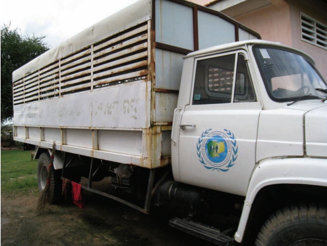
Social Affairs truck used to round up groups considered “undesirable” to take them to Social Affairs centers around Phnom Penh.

Treated with contempt, people who use drugs are routinely denied basic rights when arrested. Teap, who is 14, reported being beaten and electrocuted in police custody in order to extract a confession.