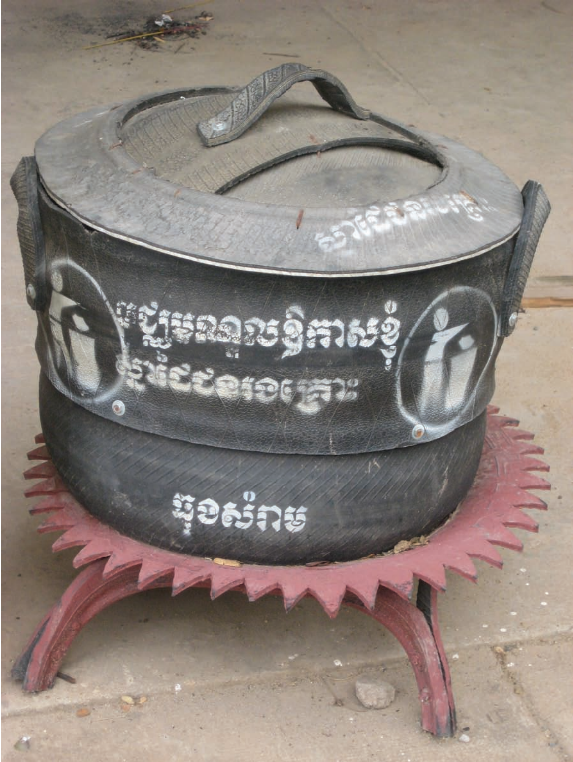
"We spray paint the rubbish bins with 'Made by the victim' in white paint."