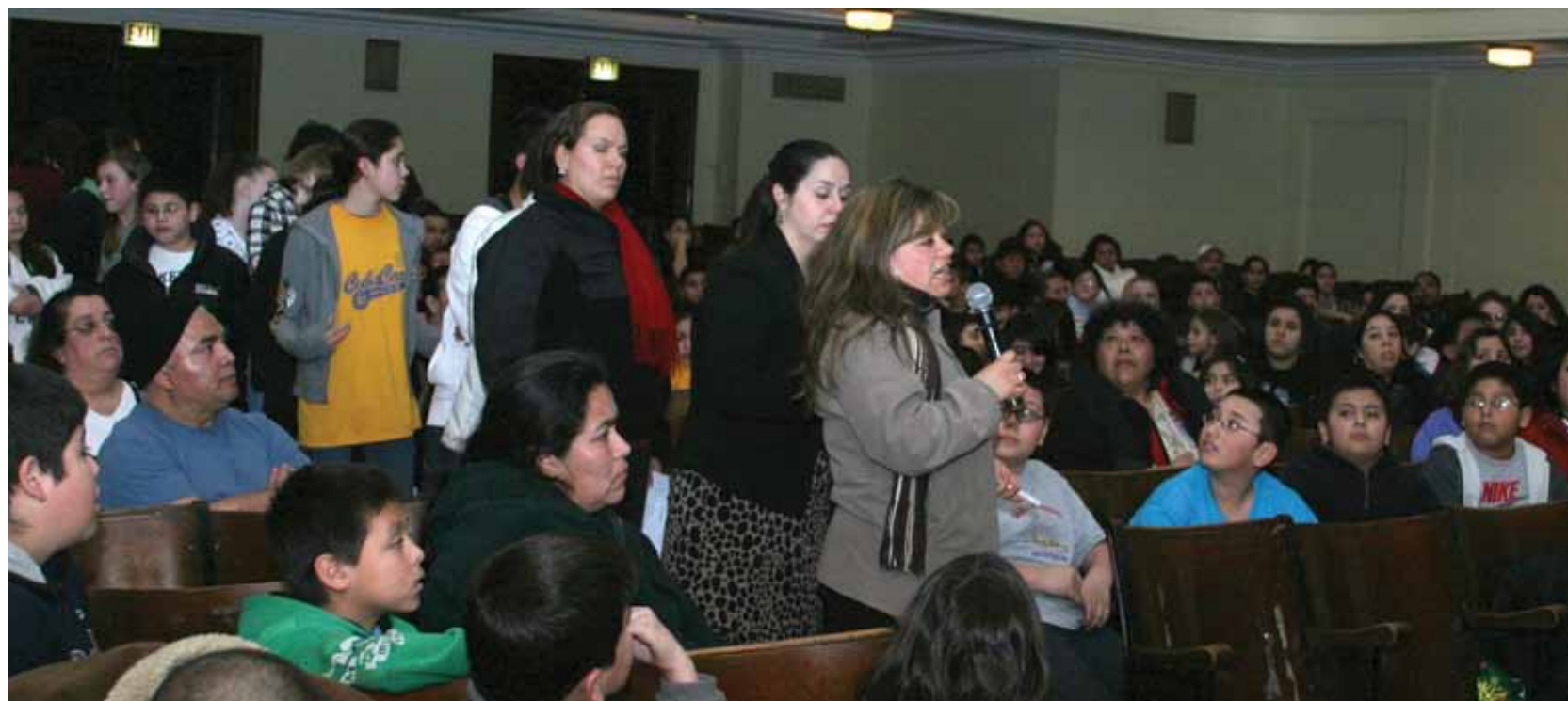
Teachers, parents, students and community members speak out against Gunsaulus principal at last March's Local School Council meeting.