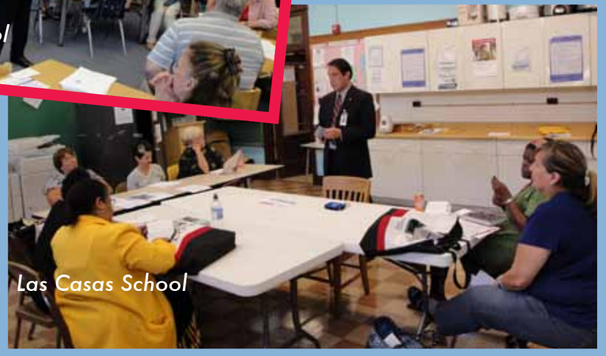
Las Casas School