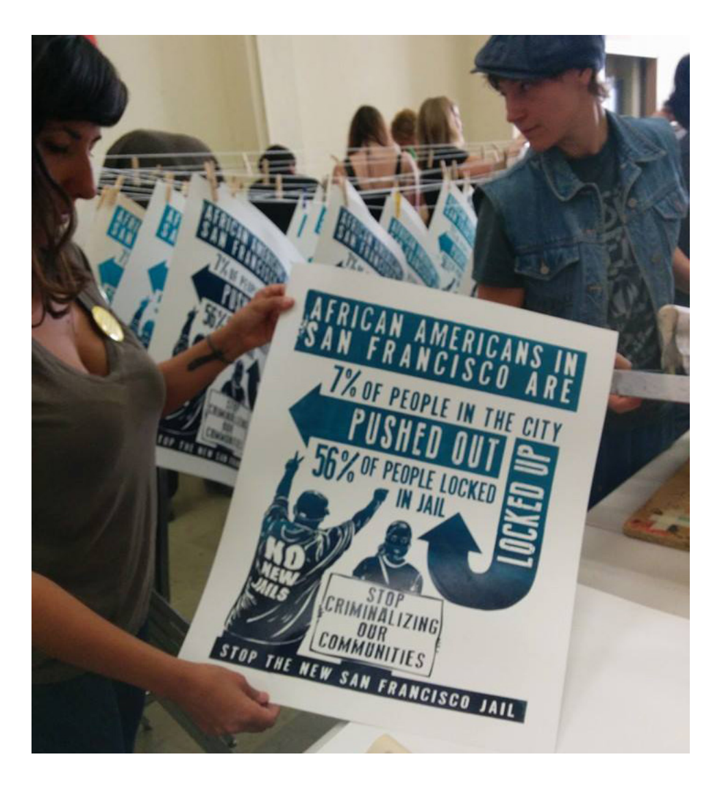
15. Source: http://www.raincityhousing.org/

• Person-Centered: Rain City offers person-focused harm reduction with a variety of different programs including supportive housing where sex workers can work, use substances safely, and have a place to sleep.