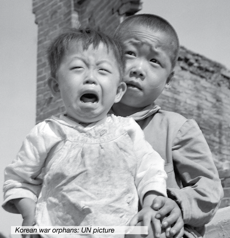
Korean war orphans: UN picture

Children, the elderly, the disabled, and the poor are especially at risk during wars. And many recent armed conflicts have been in underdeveloped countries.