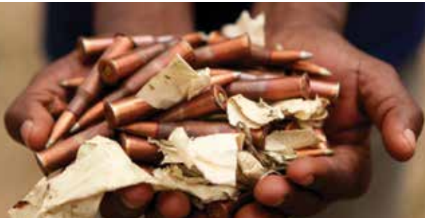
Ivory Coast

Join ICAN activities to support a ban on nuclear weapons: www.icanw.org