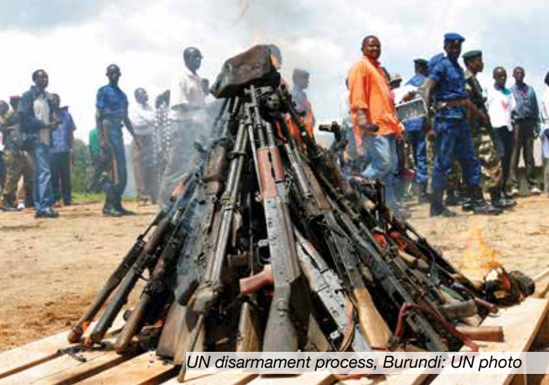
UN disarmament process, Burundi