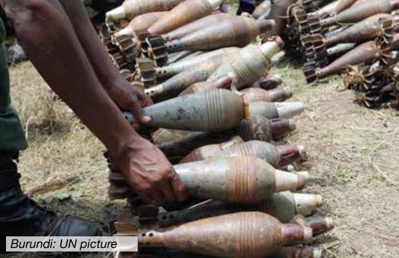
Burundi: UN picture