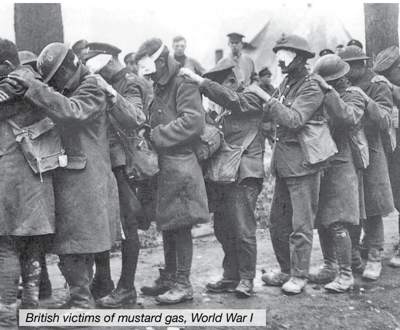
British victims of mustard gas, World War I

Countries around the world have agreed to ban weapons which cause unnecessary suffering, or which kill indiscriminately.