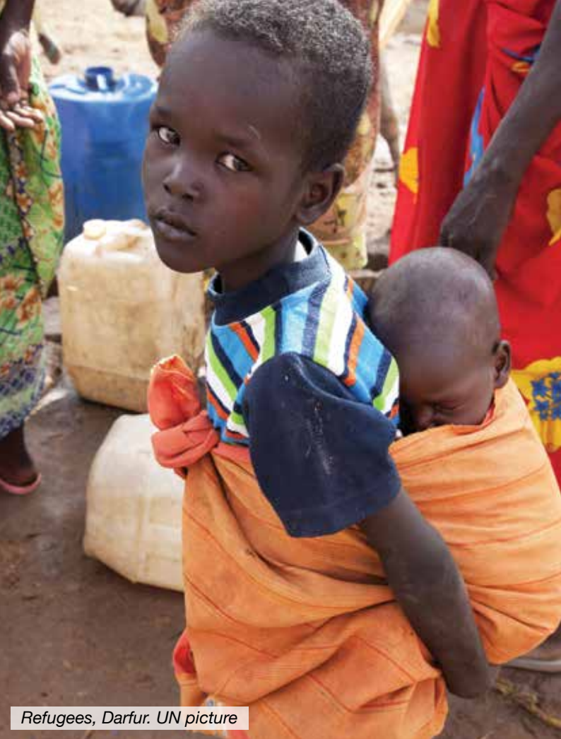
Refugees, Darfur.