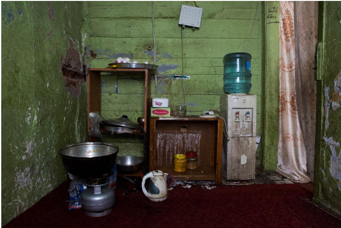
The kitchen for 15 Afghan and Pakistani asylum-seekers living in Istanbul.

living in one small and partly underground room; two single beds, a table, and a refrigerator occupied virtually the entire space. 95