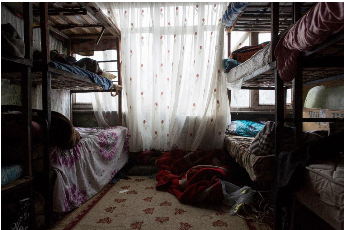
About 12 asylum-seekers from Afghanistan live in this room in Istanbul, below which is an industrial operation where the recyclable materials that they collect from the garbage are weighed and sorted.

This chapter assesses whether Turkey meets the third criterion for effective protection: access to means of subsistence sufficient to maintain an adequate standard of living. With state authorities unable to meet people’s basic needs – in particular shelter – combined with the significant barriers that people experience in achieving self-reliance, the reality is that Turkey is failing to provide an environment where asylum-seekers and refugees can be guaranteed the ability to live in dignity.