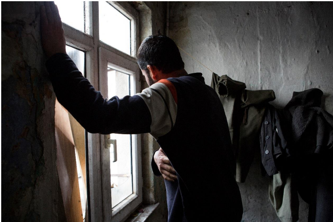
An Afghan asylum-seeker looking out from his flat in Istanbul.

EU member states should be looking at activating such a scheme, in meaningful numbers, without delay.