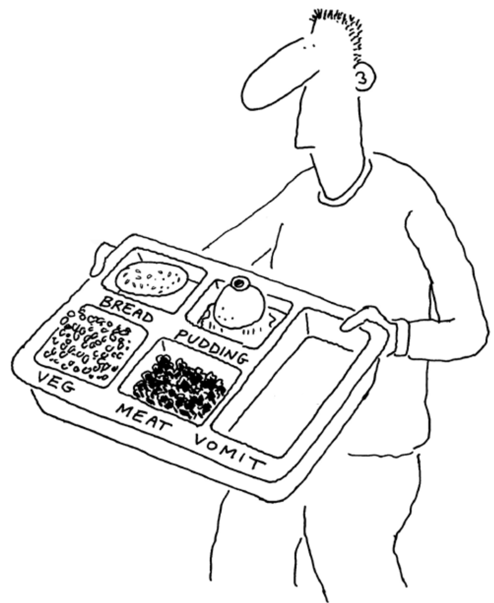
A Menu sheet from HMP Wormwood Scrubs

All dishes are subject to availability and may change without prior notice All medical dietary needs must be reported to the kitchen through the Medical Officer / Doctor