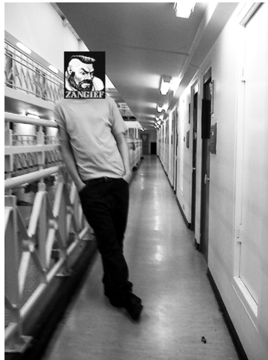
The author relaxing in HMP Wandsworth

Prisoners Education Trust The Foundry, 17-19 Oval Way, London, SE11 5RR