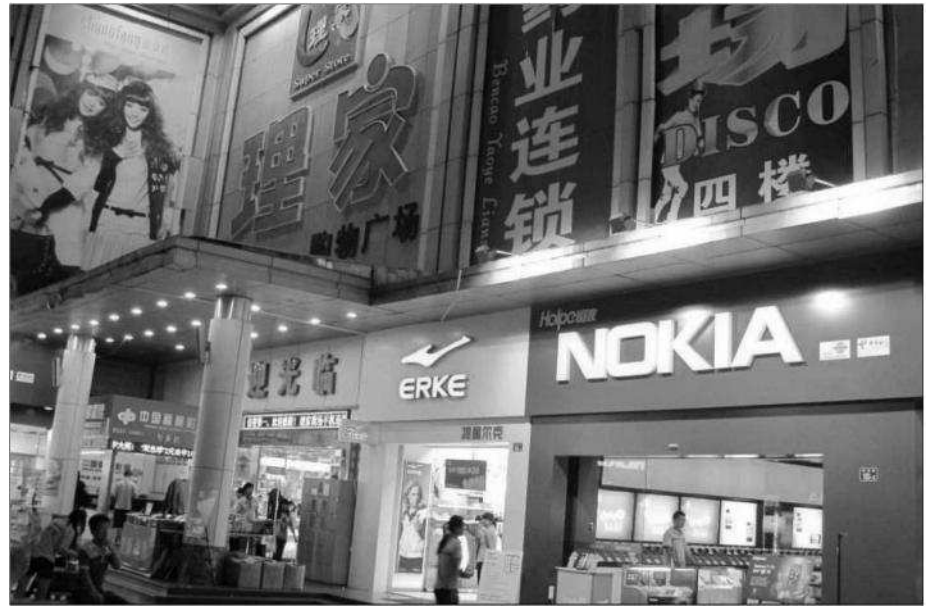
Disco, boutiques, supermarkets, and branded stores targeting young consumers are among the popular places frequented by workers living in the Foxconn dormitory zone in Shenzhen, China.

many among the first generation of rural migrants drawn to the labor market into the 1990s returned to their villages to marry, settle in, and raise children.<sup>13</sup> But with the new generation, the times have changed and many rarely return to settle in the villages of their registration.<sup>14</sup>