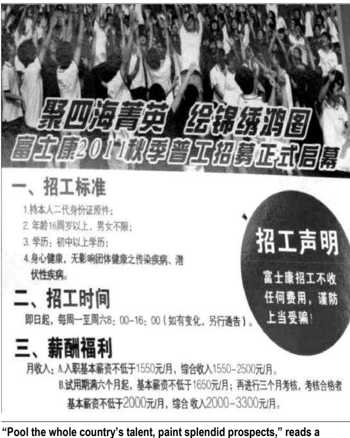
"Pool the whole country's talent, paint splendid prospects," reads a colorful Foxconn recruitment poster (2011). According to the ad, a Foxconn worker in Shenzhen will receive (a) a basic monthly wage of 1,550 yuan; (b) after probation (six months), 1,650 yuan; after evaluation (three more months), 2,000 yuan. Total income, with overtime: 2,000 to 3,300 yuan/month.

population, down 6.3 percent compared with the 2000 census data. All of these indicators suggest a reduction in the labor supply in coming decades.<sup>73</sup> China's leaders have begun to recognize these demographic realities<sup>74</sup> and are trying to boost labor productivity through expanded investment in rural education and vocational skill training. At the same time, this has compounded worker frustration as rural migrants often find themselves excluded from training and promotion programs, trapped in permanent minimum-wage jobs.