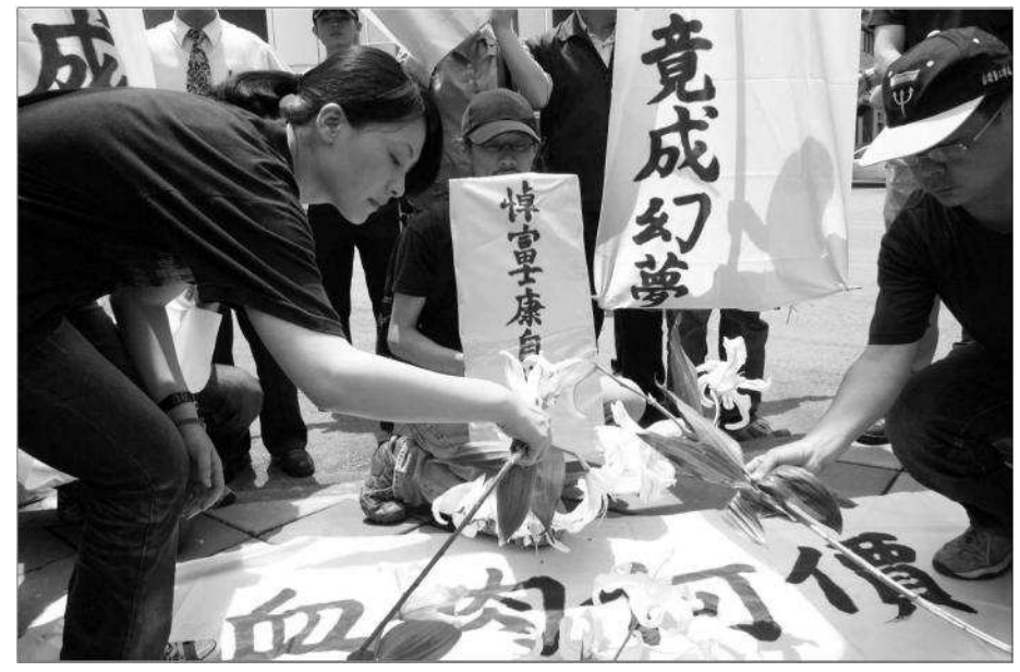
The banner on the ground reads, "What is the price of a human body?" Taiwanese demonstrators protested outside Hon Hai's Taipei headquarters on 28 May 2010, urging the company to respect life and improve treatment of its workers. They laid flowers to remember the Foxconn worker victims in China.

continued since.<sup>54</sup> As of January 2012, China had a total union membership of 258 million, by far the largest unionized workforce in the world.<sup>55</sup> Of these, 36 percent (94 million) were rural migrants, who comprised the fastest growing segment of the unionized workforce since the early 2000s.<sup>56</sup> The official slogan of the All-China Federation of Trade Unions (Acftu) is "When there's trouble, seek the trade union." But worker activists again and again found both official and company unions unresponsive to their plight and turned to strikes and other protest actions. Will the expanded trade unions prove any different? Will the local state prioritize worker interests over those of international and domestic capital?