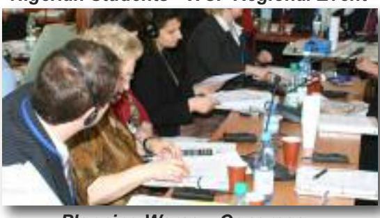
Planning Warsaw Congress