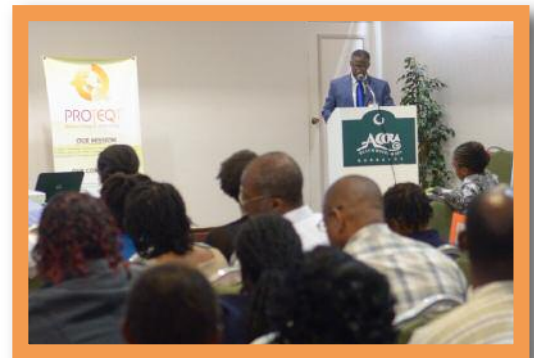
WCF Conference in Barbados, 2016

has organized nine successful World Congresses of Families, on three continents, since 1997, as well a dozens of regional events from Vancouver to Moscow, London to Latvia and Barbados to Nigeria.