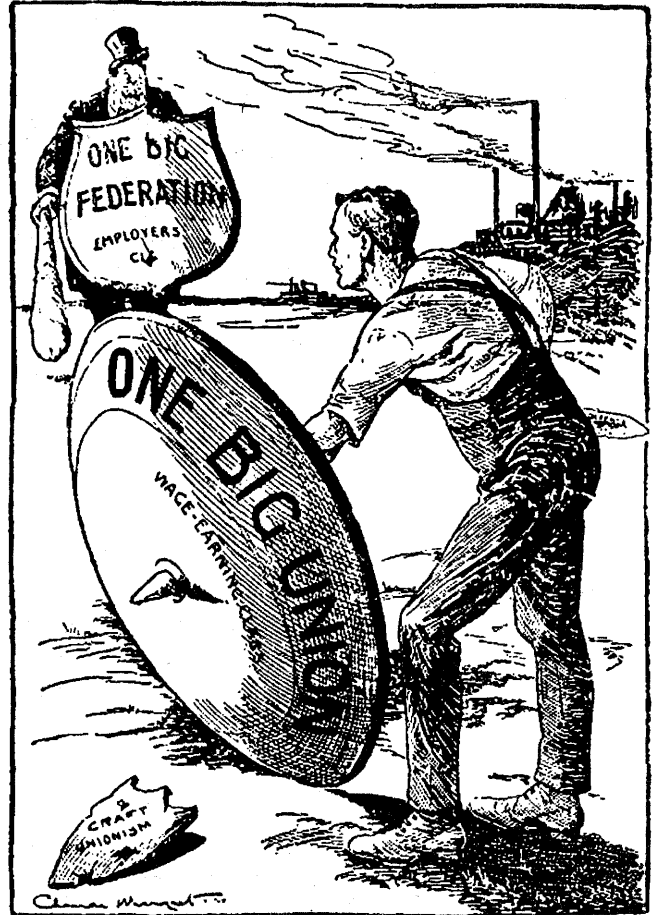
THE EMPLOYER (as Labour grips the new shield): “Heaven help me! The rascal’s getting wise, and taking a leaf out o’ my book!”