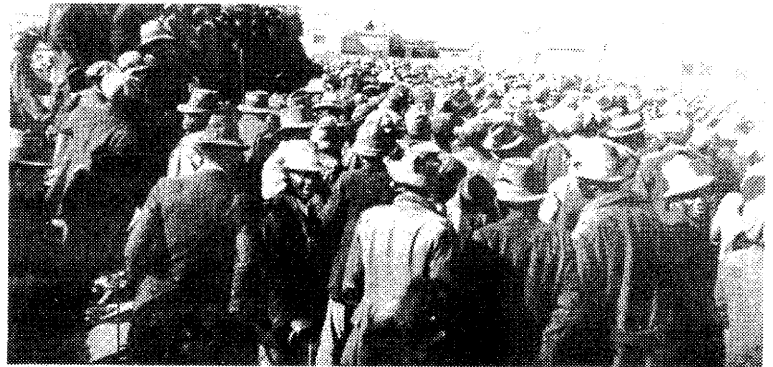
Rally in Johannesburg, 19 June 1918: Speakers from Industrial Workers of Africa, ISL and TNC call for an African general strike

A leaflet was issued in two African languages in 10,000 copies, urging all African workers to join the union, and distributed widely in the Transvaal. “Workers of the Bantu race,” it asked,