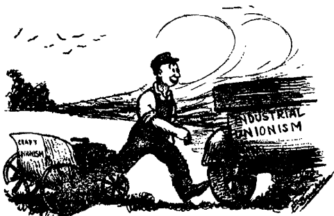
Cartoon from the International, 23 January 1920: “Industrial Unionism in South Africa demands solidarity with the Native and Coloured Striker.”