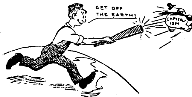
Cartoon from the International 2 April 1920: The revolutionary strike defeats capitalism in "The Best Strike of All."

These and other gruesome deeds are demanded of you who respond to the ironical call of 'your country needs you!' Truly it does! In your country there is always unemployment, high rents, and dear goods, there is always bad housing and disease, there is squalor and filth in home and factory, there is poverty and starvation. So YOUR country needs you! ... Yes! YOUR country needs YOU. Are you prepared to fight for your country and help to bring wealth, happiness and peace with ALL people? 19