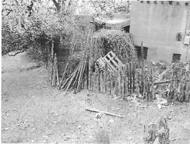
Latilla fencing bordering Couse Pasture (facing west)