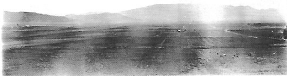
View of Taos Valley from Couse Pasture, circa 1905.