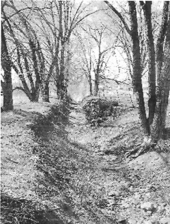
Historic acequia and Cottonwoods- northeast boundary