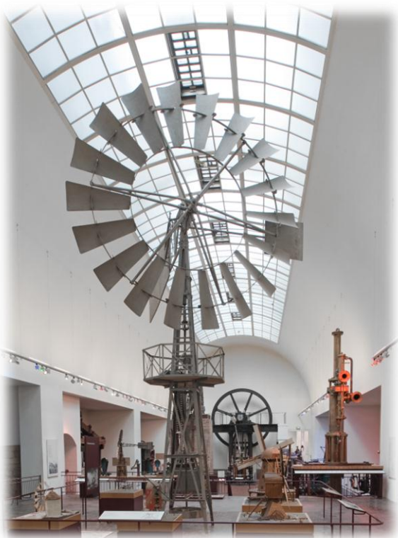
The hall of Power Machines shows the transition from the solar to the fossil era in the course of industrialization at a glance.