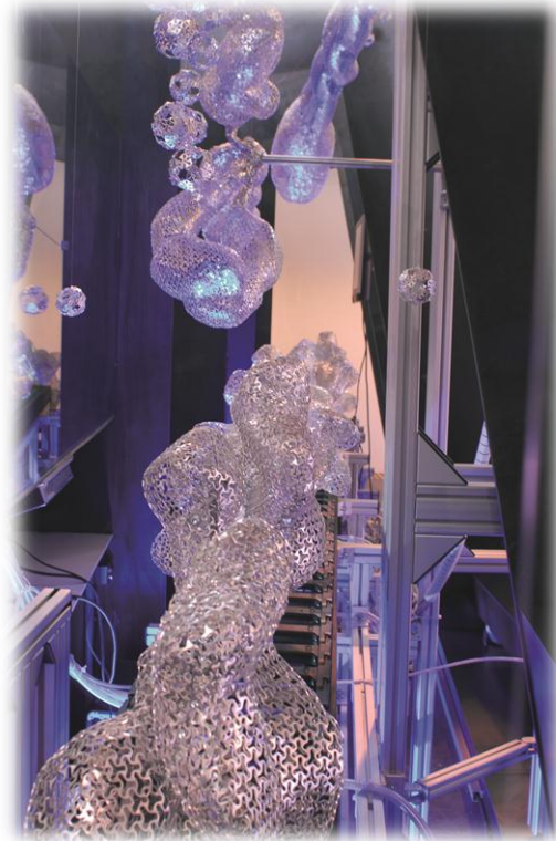
The Center for New Technologies envisions scenarios for an open future of natural sciences and technology.

In the tradition of the Deutsches Museum, the exhibition will show both historical artifacts and current objects from scientific and industrial laboratories and integrate the audience by means of interactive demonstrations and direct participation through digital media. Combining information and participation, the Deutsches Museum offers the public a unique opportunity to share available knowledge, pose questions and express concerns, evaluate answers and form an opinion. Above all, the exhibition enables the visitors to approach this fascinating topic in an instructive, but also exciting and enjoyable manner.