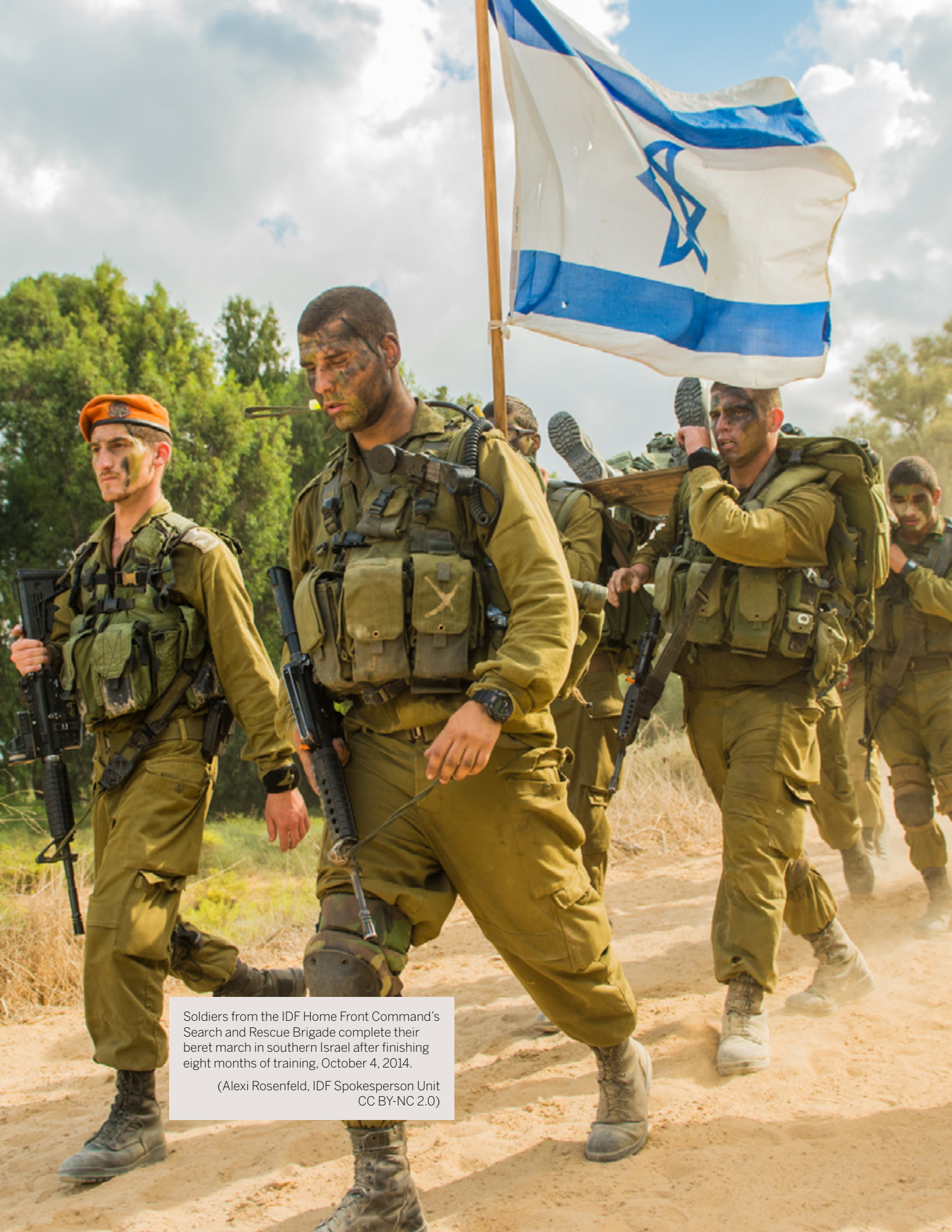
Soldiers from the IDF Home Front Command's Search and Rescue Brigade complete their beret march in southern Israel after finishing eight months of training, October 4, 2014.