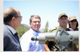
Secretary of Defense Ash Carter and Israel's Minister of Defense Moshe Ya'alon looks out on the Hussein lookout at the Israel-Lebanon border on July 20, 2015.