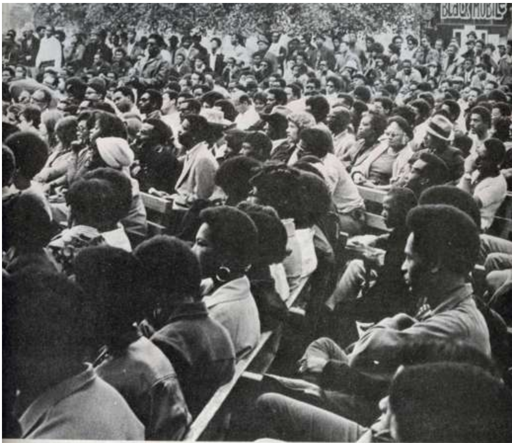
America the beautiful . . . but there is tension when civil rights leaders speak to their people.

stally shunning con- s with whites, irres- whether the whites elves unracialist or don't want to take the ly insulted. se, the whites are ground and accusing of being "racialists." can a white man what he has never against a people whom have insulted a life just because of ur, and completely ed with any behavi- a part? That's where is at, white baby hen no offence is becomes so condi- pecting offence that est that offence is instance, one night club in Louisville, my companion and I I were asked to move set table because a