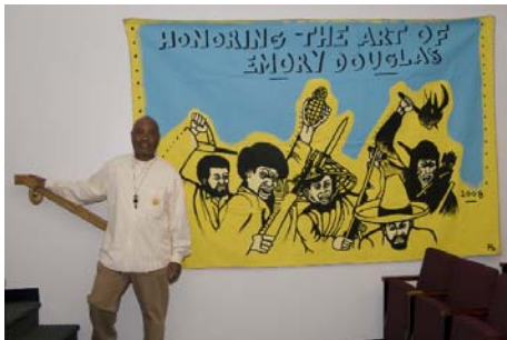
Emory Douglas