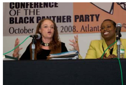
Kathleen Cleaver and Cynthia McKinney

A panel discussion examining the devastating effect of the government's counter-intelligence (COINTELPRO) program on the Black Panther Party and other Black Liberation organizations was the most popular event of the day with over 200 persons in attendance-- It was standing room only!