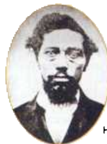
DANGERFIELD NEWBY, HUNG

ritories. Instances of this were murderous uprisings of blacks either alone or with allies of Indians or white indentured servants in Connecticut in 1657, Virginia in 1663, Long Island in 1708, New York in 1712, Massachusetts in 1723, and South Carolina in 1739. Many others occurred in the British West Indies, such as Barbados in 1816, Demerara in 1823 and Jamaica in 1831. In South America blacks waged full scale wars against whites and sometimes established independent states, such as the legendary Palmares Republic in Brazil, to govern themselves. Wherever blacks were enslaved, they rebelled.