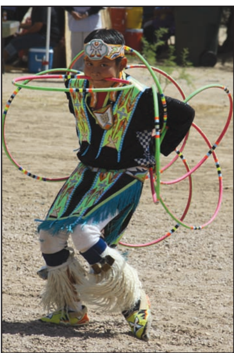
A Yellow Bird dancer performs the "Hoop Dance".