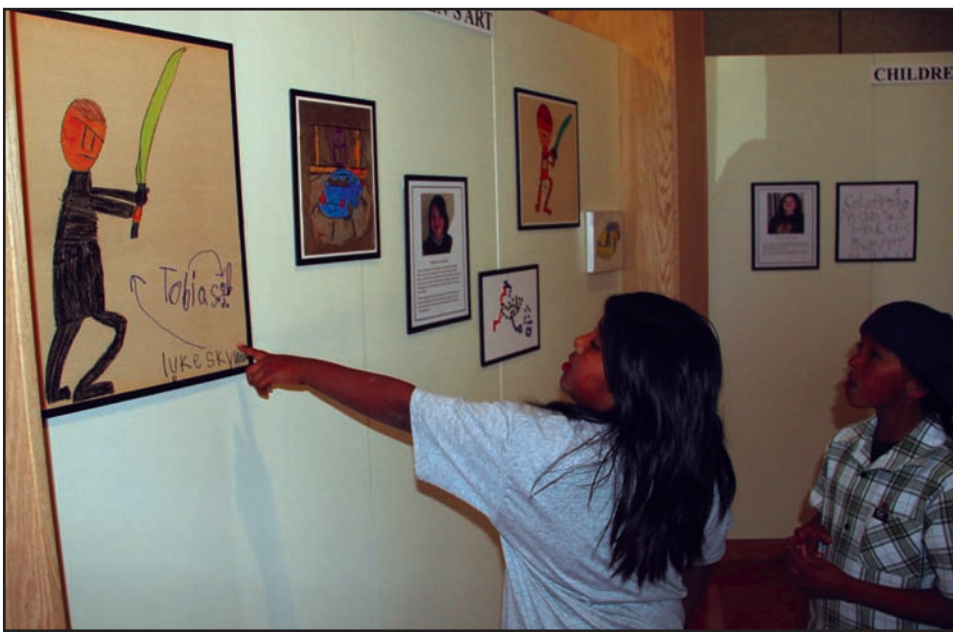
Young visitors to the exhibit area point out a particular drawing of interest to them. The exhibit area, which was dedicated to community youth arts & crafts, was entitled "Celebrating Ak-Chin's Youth & Their Art".