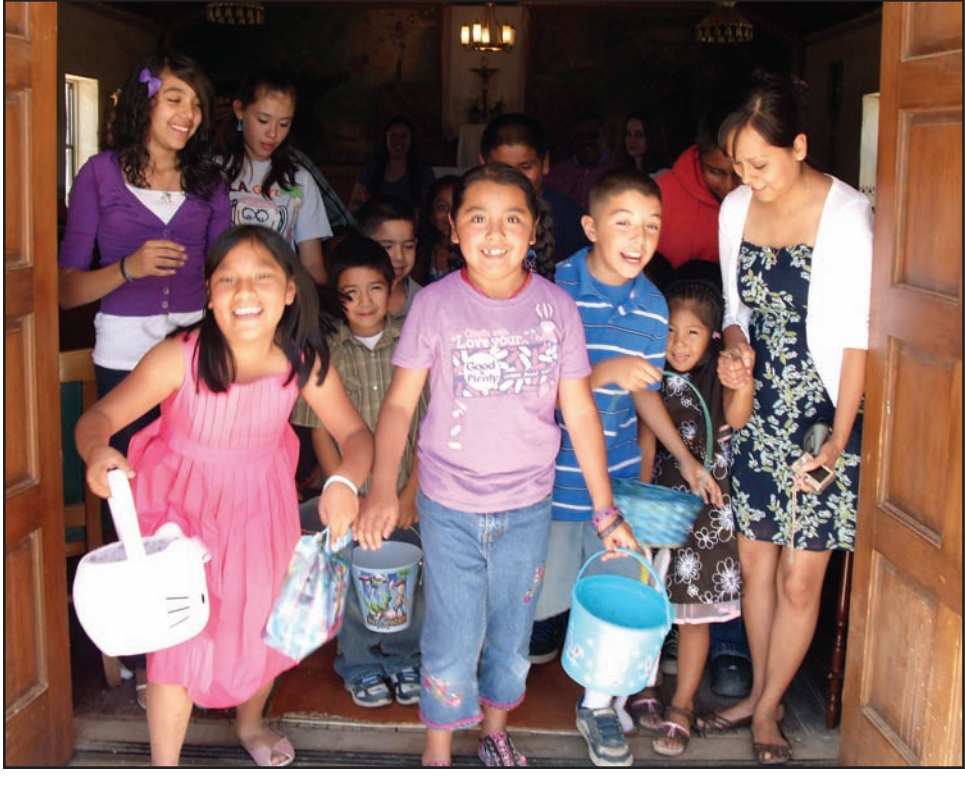
Children dash out the church doors at St. Francis on Easter Sunday in hopes of finding lots of eggs.