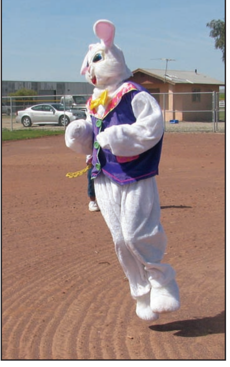
The Easter bunny hops his way towards second base during a friendly game of kickball.