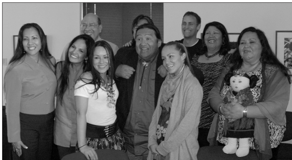
The cast from the movie "More Than Frybread" gather for a quick photo. The movie is in production and with plans for release later this year.