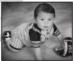
To My Little Man,

You are such a big boy and have brought so much happiness to me and daddy's life. This has been a tough year (we miss you Daddy!) but all your smiles and laughter has gotten us through it all. You inspire and amaze me everyday. We will do our best to help you become a great person and always give you the best of ourselves. Until then, stay awesome, stay happy and keep on "pushing me to the limits". Happy Birthday! Love, Momma & Daddy