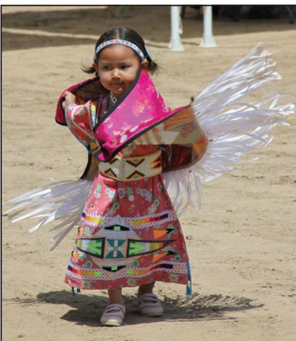
Right: A young dancer with the Lane Jense-Yellow House dance group performs a "Fancy Dance" much to the delight of the crowd on hand.