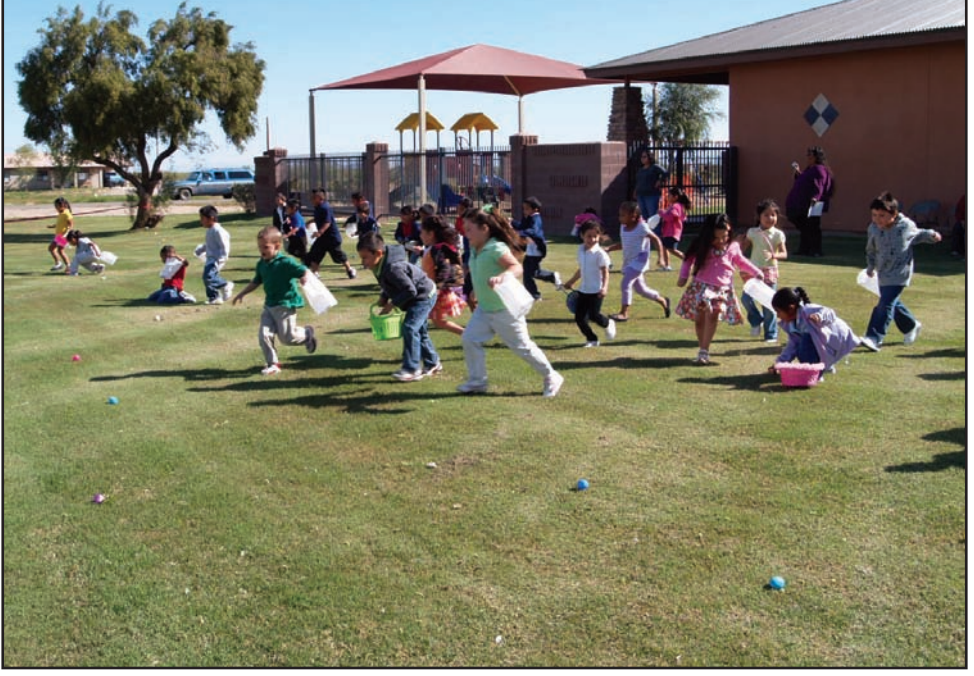
Ak-Chin Child Development students make a mad dash towards eggs during their annual easter egg hunt.