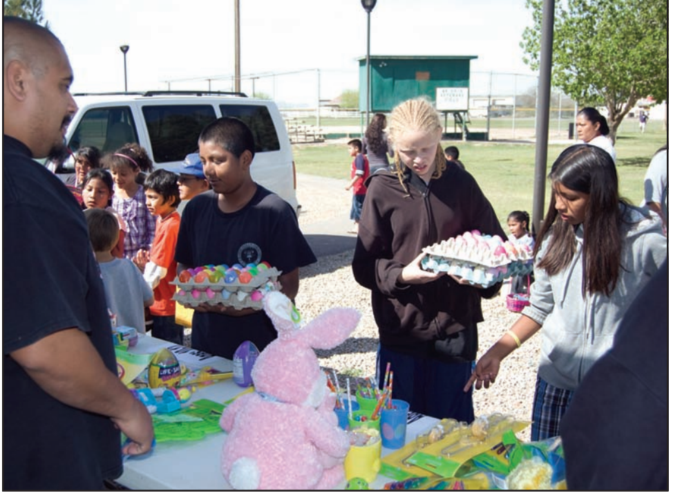
Left: Egg hunters have a number of prizes to choose from during the Ak-Chin Recreation Easter Egg Hunt.