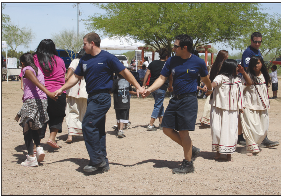
Members of the Ak-Chin Fire Department get into the performance by taking part in the "Social Round Dance".