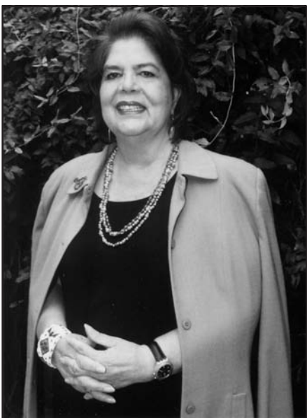
Wilma Mankiller (1945 - 2010)