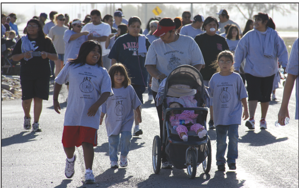
Top: Walkers make their way down Farrell road from the Ak-Chin Fire Department to the Him-Dak Museum grounds early Saturday morning. All participants received a free t-shirt.