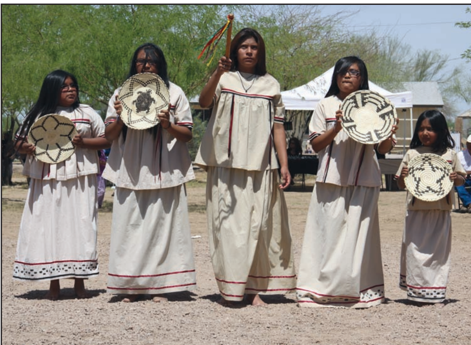
Ak-Chin Baban Kehina Dancers from the Ak-Chin Community, perform a traditional song during their performance at the Him-Dak Celebration.