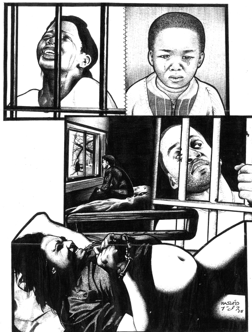
art credit: http://rashidmod.com/