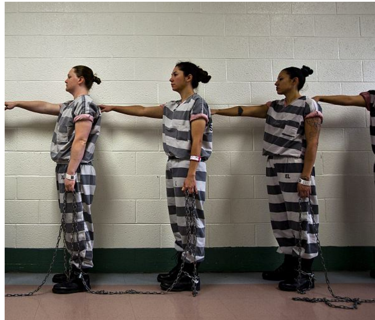
A PROJECT OF THE INCARCERATED WORKERS ORGANIZING COMMITTEE OF THE INDUSTRIAL WORKERS OF THE WORLD