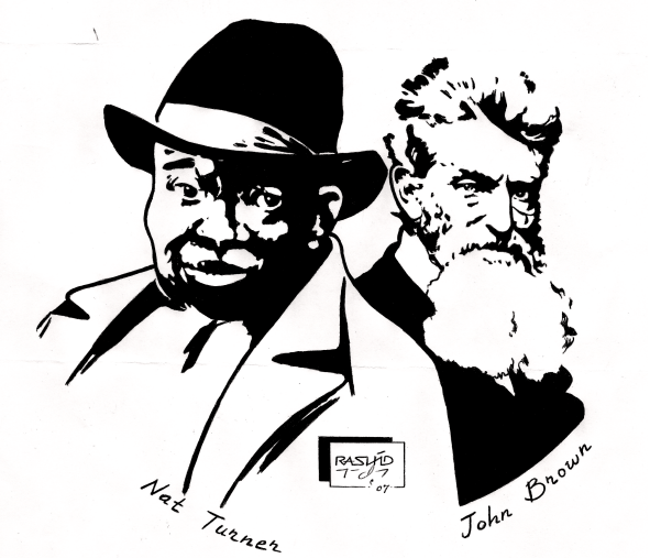
art credit: http://rashidmod.com/

When eyes are burning with mace, when blood is dripping down the face, it all becomes frighteningly clear: Capitalism is a sham; and whether in or out (of prison), as long as we live under a system that views everything and everybody as a commodity, we're all doing time. And that, at the end of the day, is the real crime--not that some of us are locked up but none of us are free!