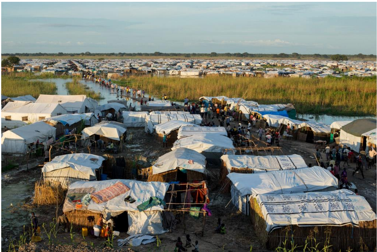
The Protection of Civilians (PoC) site near Bentiu in Unity State, South Sudan, 2014.