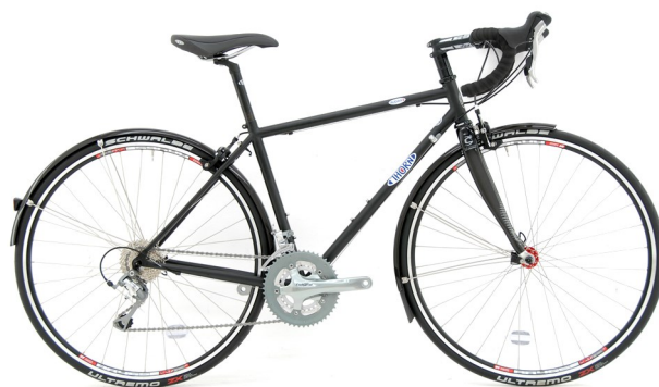
Mk3 Audax - 20sp Tlagra - weight 10Kg Size shown is SIZE 525

Our powder coated frames are treated internally with a rust inhibitor; the outside surfaces are sprayed with a rust-inhibiting primer.