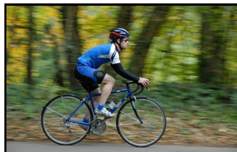
Size 525, shown with optional carbon fork