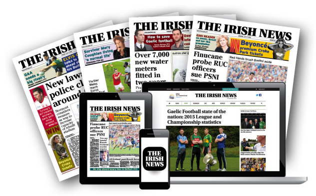
True to our words

Our responsive website enhanced with online videos, image galleries, live blogs and up to the hour breaking news attracts 23.6K DAILY USERS across mobile, desktop and tablet. Our newspaper is also available to download and view through our mobile app.