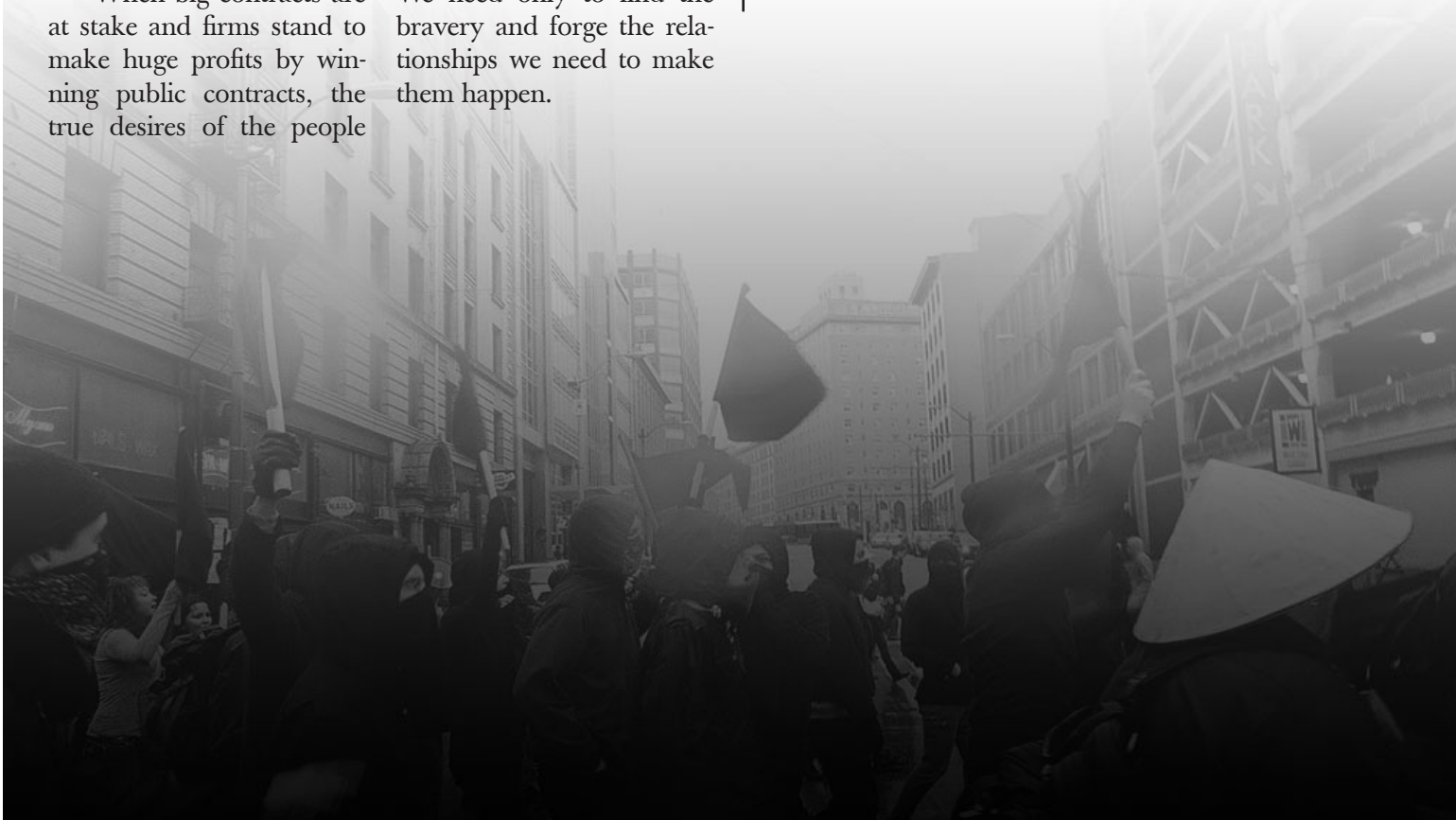
Anti-police demonstration passes through downtown Seattle on February 12th, 2011.

The first signs have already arrived, in the form of prison resistance, anti-police actions, and anti-austerity demonstrations occurring across the country. As was written on a wall during the student revolts in France 1968: Their nightmares are our dreams. 🐼