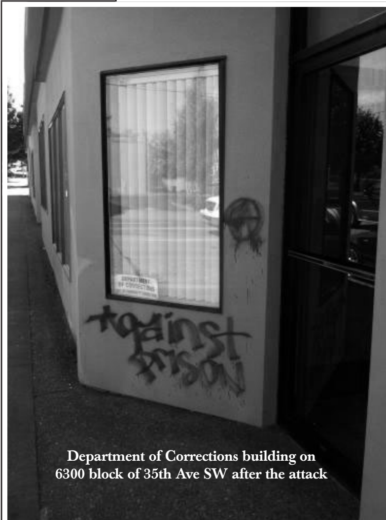
Department of Corrections building on 6300 block of 35th Ave SW after the attack