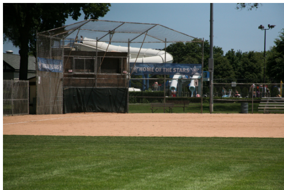
Park District of Forest Park, Softball 7501 West Harrison Forest Park, IL 60130