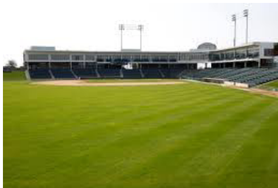
Schaumburg Boomers Stadium, Baseball 1999 Springinguth Road Schaumburg, IL 60193