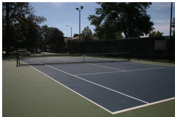
Park District of Forest Park, Tennis 7501 West Harrison Forest Park, IL 60130