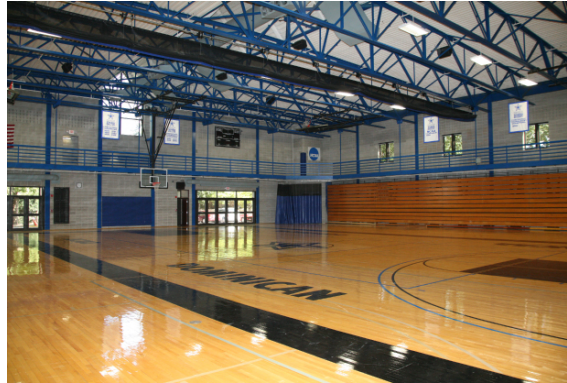
Igni Sports Forum, Basketball/Volleyball 7900 West Division Street River Forest, IL 60305