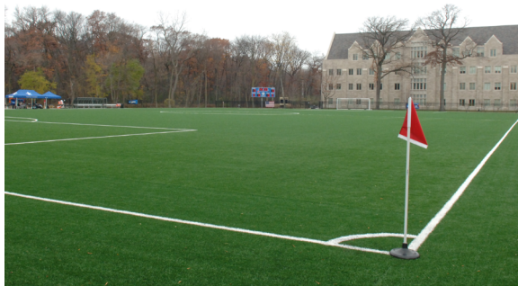
West Campus Field, Soccer 7900 West Division Street River Forest, IL 60305