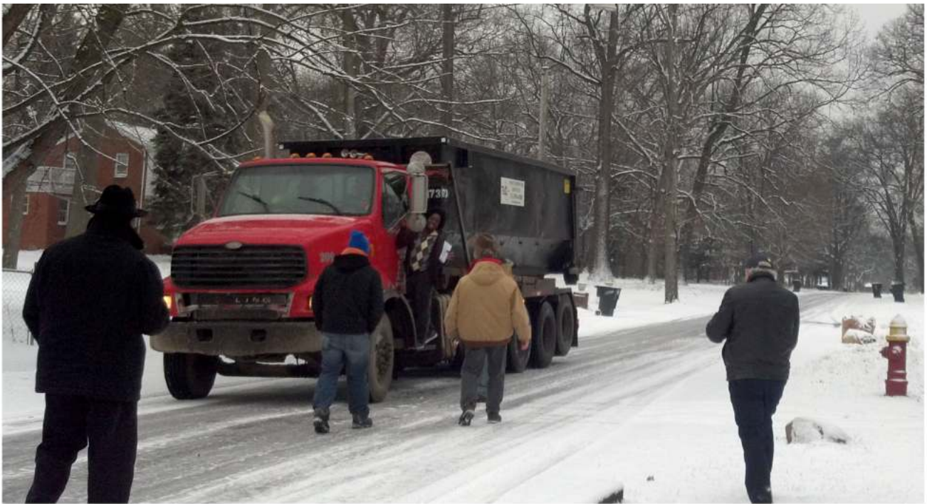
No Dumpster = No Eviction : Garrett Home Defense 1-30-2012

Here are a few short ideas on building connections in the communities.