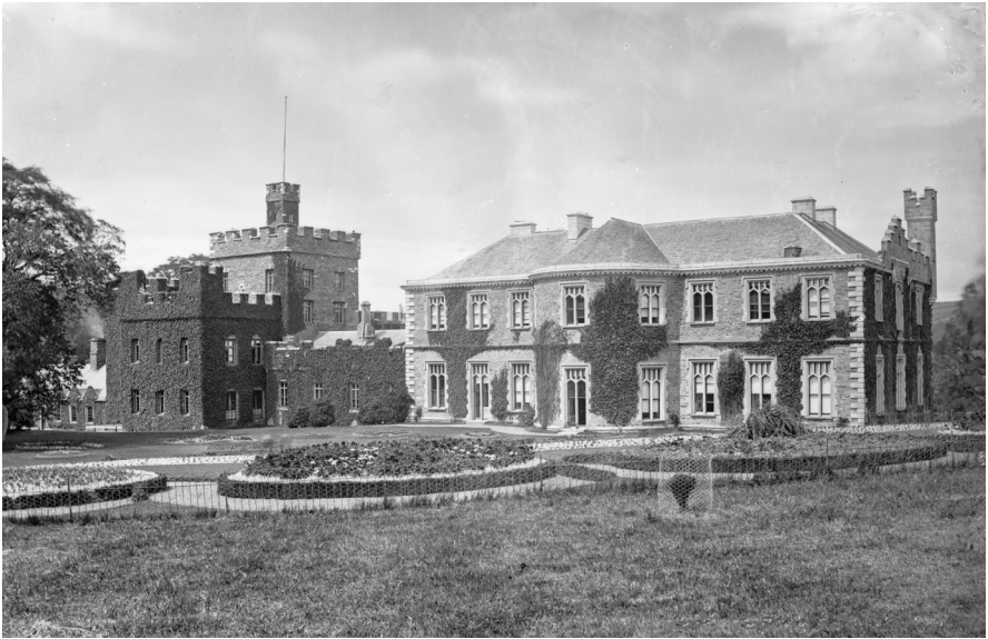
FIGURE 7. Castle Bernard, Bandon (Garden Front): Mansion of the 4th Earl of Bandon and Georgina, Countess of Bandon.

all the roads leading to the castle to frustrate any attempt to save it, the incendiaries created what was for decades “one of Ireland’s most spectacular ruins.” 204 Puxley sought as much as £130,000 in compensation, though he was nominally awarded only £60,000 at the Skibbereen quarter sessions in the following October. 205