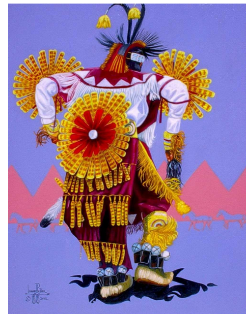
I Dance With the Spirit of the Horse (2003)