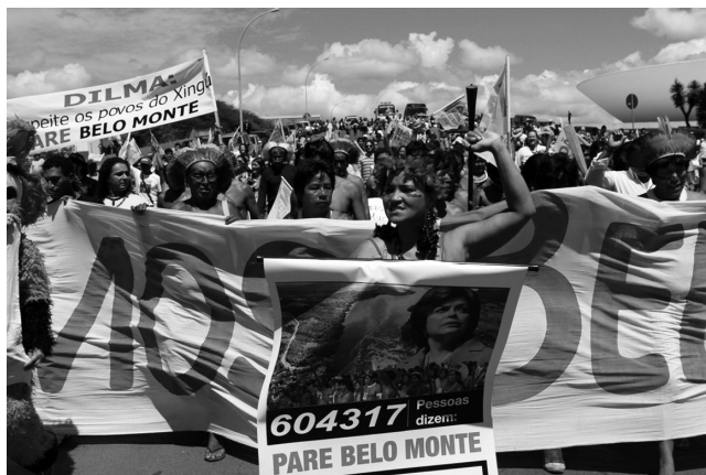
Images of resistance to Belo Monte Dam

Oct 27 - Belo Monte Dam construction site is occupied by 400 indigenous people, fishermen and community members: The occupation was a collective decision made by 700 representatives from local communities who attended a seminar against the Belo Monte Dam held the week before. Participating groups