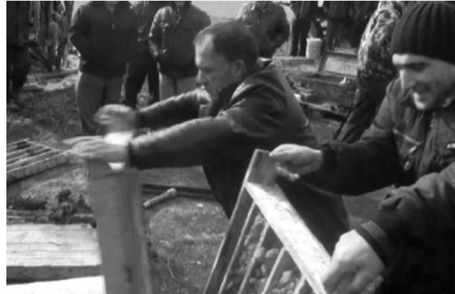
Protesters destroy drilling samples at a would-be iron mine near Hrazdan

a banner reading "Not with Our Money" from atop two 50-foot flagpoles at the Bank of America's headquarters in downtown Charlotte, North Carolina. Six more arrested below—two while supporting the climbers, and four while blocking the main entrance to the bank's headquarters.