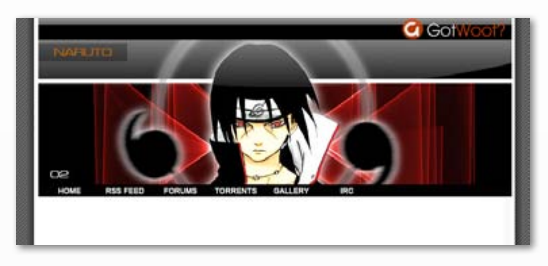
Volunteers translate many different anime series