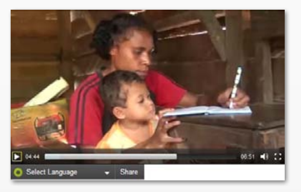
'Love Letter to the Soldier', an example video available in six languages

Translation and subtitling of videos, combined with social networking online, can help campaigners build collaborations beyond their borders, enabling them to share tactics, stories, strategies and support.