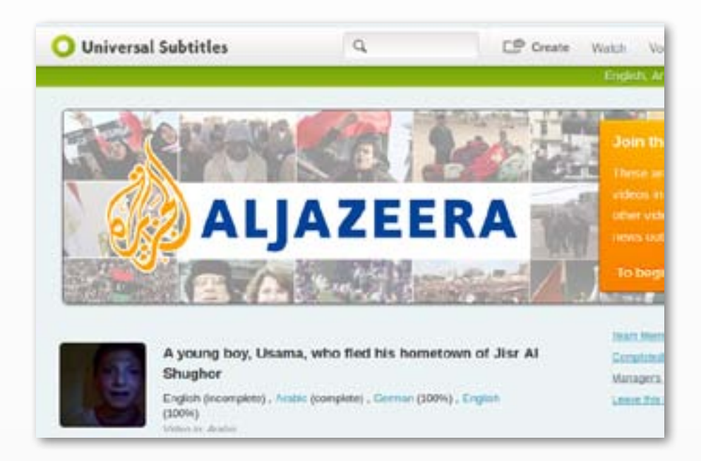
Al Jazeera's Volunteer Team