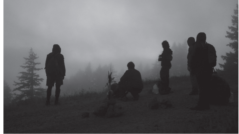
Fog rolls over the Mattole forest in Humboldt County, CA, currently under threat from HRC's logging plans.

At the turn of the century, the monkeywrenchers decided to make their forest home more permanent and set up shop at the company's main entrance. This encampment was dubbed the "Mattole Free State." Taking turns living in tarp shelters, activists worked on and off for several years, saving two-thirds of the living forest from destruction and bankrupting the MAXXAM Company, who was in charge of the clearcutting. Now the Humboldt Redwood Company (HRC) is attempting