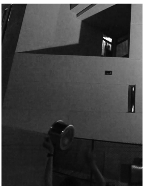
A prisoner waves from inside the Broward County Jail as protesters bang pots outside: Ft. Lauderdale, Florida, Dec 31, 2015.

Hopefully by next year we'll be writing about the end of the prison-industrial-complex and can all party to our heart's content on New Year's Eve. If not, we hope you are making plans for December 31, 2016.