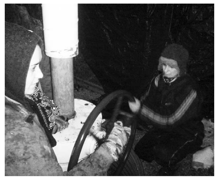
Two activists manually shut down Line 9 at an Ontario station before locking to the valve. December 21, 2015.

Unfortunately, while these actions demonstrated how effective a few people with bicycle locks can be against a giant corporation, other recent opportunities to resist Enbridge have resulted in compromise. On December 22, 2015—the day after the second pipeline shutdown the Tribal Council of the Red Lake Nation in northern Minnesota ended their ongoing dispute with Enbridge by accepting an $18.5 million offer. Four of Enbridge's pipelines trespass on Red Lake Nation tribal land, and for years members of the Red Lake Nation called for using the land as leverage against the corporation to force them to move the pipelines or halt the flow entirely. However, the decision to exchange land with Enbridge was made behind closed doors by the Tribal Council in a six-tofour vote. Red Lake Executive Administrator Charles Dolson said that $18.5 million was the "best settlement the tribe could have hoped for." Highlighting why many people were enraged, Enbridge stated, "This agreement and land swap will allow both parties to meet our present and future interests in this property." One tribal member stated, "The integrity of our nation was sold."