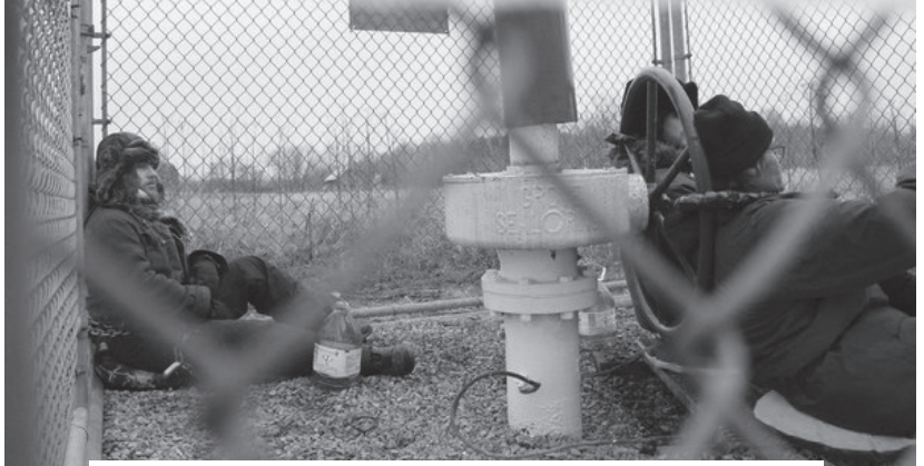
Activists in Quebec lock to a Line 9 valve. Dec 7, 2015.