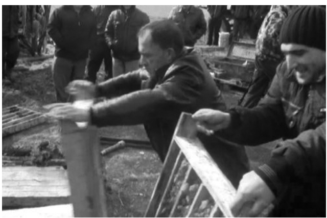
Protesters destroy drilling samples at a would-be iron mine near Hrazdan

a banner reading "Not with Our Money" from atop two 50-foot flagpoles at the Bank of America's headquarters in downtown Charlotte, North Carolina. Six more arrested below—two while supporting the climbers, and four while blocking the main entrance to the bank's headquarters.