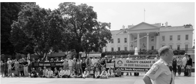
1000+ arrested protesting tar sands, Washington, DC. August 2011.

A group of Moscow activists with Wild Idaho Rising Tide were arrested for blocking US 95 to protest a massive Exxon/Imperial Oil "megaload" shipment destined for the Alberta Tar Sands. In solidarity with the First Nations people of Canada and the thousand-plus people arrested in Washington DC this summer, they are calling for the denial of permits for construction of