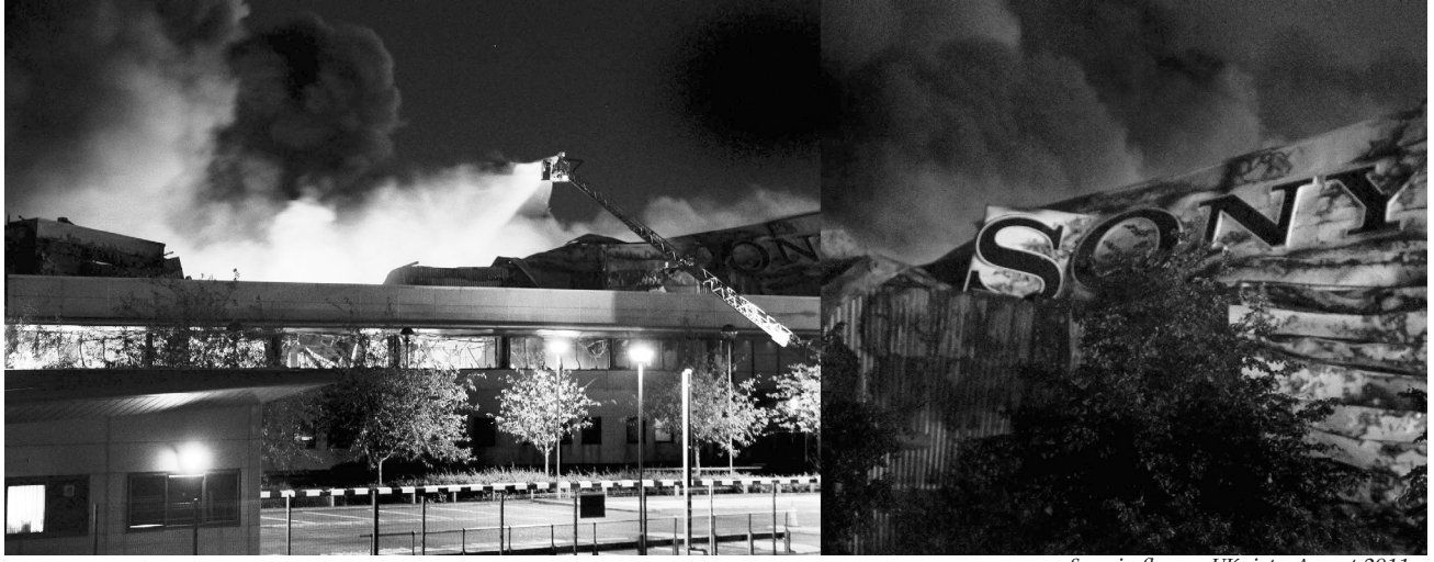
Sony in flames, UK riots, August 2011

Niger Delta is one of the most polluted places on Earth, according to a UN report. The report puts pressure on Shell Petroleum Development Co., the major operator during the period, which has had a bitter relationship with communities. It produces about 40% of Nigeria's oil in a joint venture with the Nigerian National Petroleum Corp.