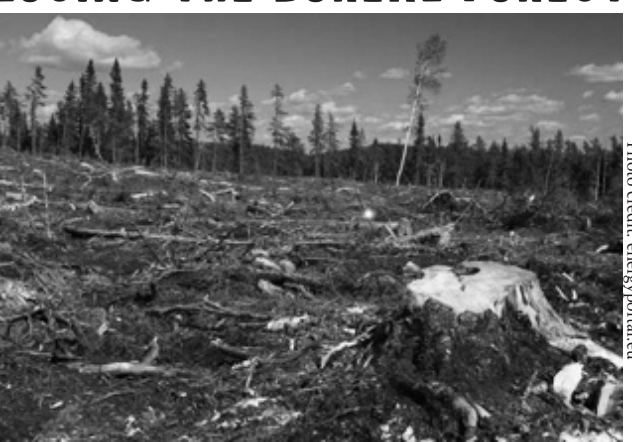
The future of the Boreal Forest and the devastation of deforestation.

In the end, what they are calling the new direction of the environmental movement is actually just a tactic to maintain hype and popularity at a time