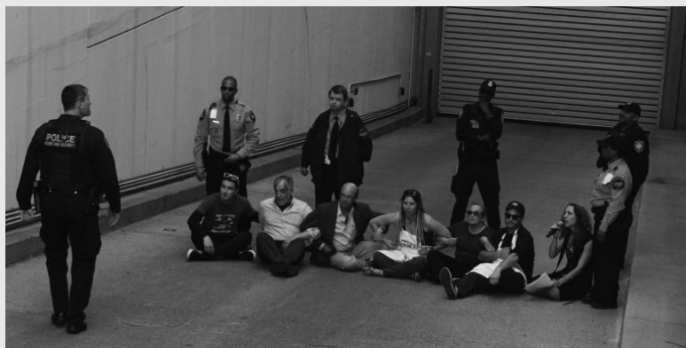
March 24, 2016

Activists and members of the Holleran family cooked pancakes on a grill outside FERC headquarters to offer commissioners the chance to meet them face-to-face and try their last maple syrup crop of the season. When commissioners declined, people linked arms and blocked the entrance to the FERC garage with their bodies, resulting in multiple arrests.