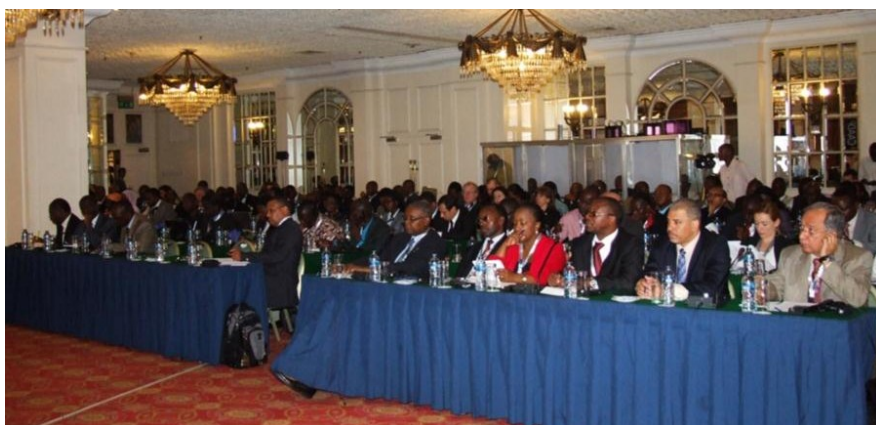
Participants of the CAADP PP Meeting, Nairobi 2012

The programme provides an innovative model to address food insecurity, agricultural development and educational attainment. It has been identified by the Millennium Hunger Task Force as a quick win in the fight against poverty and hunger. In 2003, African governments included locally-sourced school feeding programmes in their planning. That same year, NEPAD, together with the World Food Programme and the Millennium Hunger Task Force, launched a pilot programme to link school feeding to agricultural development through the purchase and use of locally produced food.