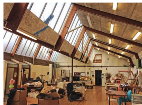
Sculpture studio, Ilam School of Fine Arts, University of Canterbury

Ilam School of Fine Arts at the University of Canterbury offers an intensive studio-based programme across painting, sculpture, photography, film and graphic design. As one of the oldest art schools in Australasia, Ilam continues to generate dynamic, critically engaged graduates who possess a high degree of conceptual and technical nous. This discipline-specific studio model provides a rich and rigorous environment where students gain a critical awareness of their practice and the language with which to describe and unpack it. In conjunction with this there is a vast range of offerings through further study electives, internships, exhibitions, symposiums, study tours, visiting lecturers and alumni master classes, which grow tangible links beyond the university and provide further developmental opportunities.