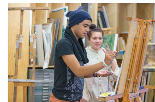
Whitireia Visual Arts and Design students at the Porirua campus

Visual Arts and Design at Whitireia features both traditional and digital streams, incorporating painting, illustration, jewellery design, textiles, printmaking, photography and graphic design, as well as the Māori art forms of raranga and whakairo.